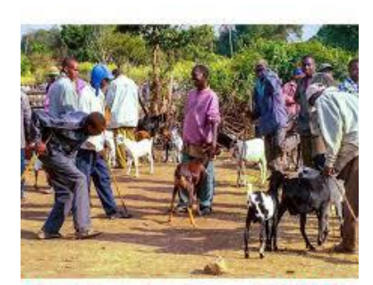
Opening day term 2 2017

The government is also presented as one that gives very little concern about the very same children whom they say they are building a future for. The paying of school fees can be said to be a reform that puts children first but there is a blind side to it. Children are vulnerable beings who easily succumb to pressure and partake in actions which they are not aware of the consequences. For instance, bullying each other which has horrible implications on the bullied child's life. One concerned social media user lamented that paying school fees through labor would subject the student to bullying from other school mates. The commotion caused at the school because of parents wanting to pay for their children's school fees with goats and labor was also a matter of concern. The social media user expressed his concern over the child's esteem and the ridicule that the child would go through if they were to provide physical labor at the school in exchange for their child's education. Through one of the social media jokes on Facebook, the picture below was circulated of parents dragging the goats to school to pay school fees. It served the purpose of showing the commotion that the proposed reform would cause at schools.