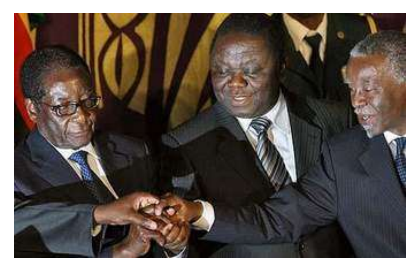
Figure 2: Former South African President Thabo Mbeki with Mr. Morgan R. Tsvangirai and Mr Robert G. Mugabe after the conclusion of the GNU signing.