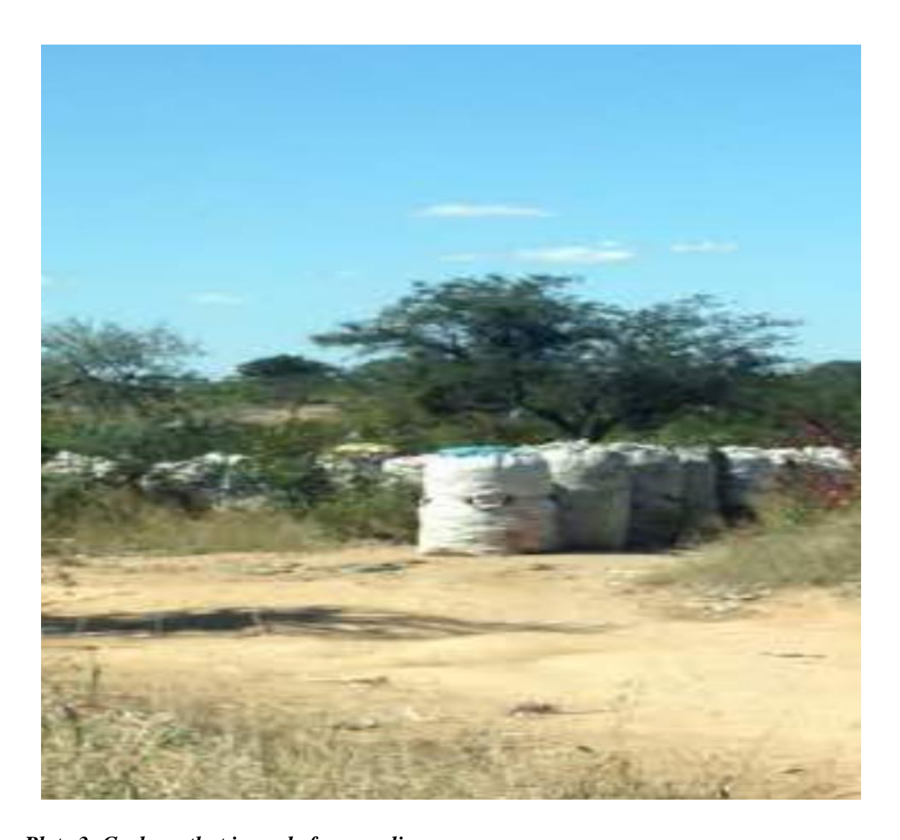
Plate 3: Garbage that is ready for recycling

The dumpsite was a source of livelihood to some settlers. As they could pick up the garbage, and sell it. The settlers would wait for the garbage truck to dump the garbage then they would proceed and pick up plastics cans, plastics, empty cans and beer empties and they will sell to companies. Recycling companies in Harare bought the plastics, cans and rubbers that they would have picked.