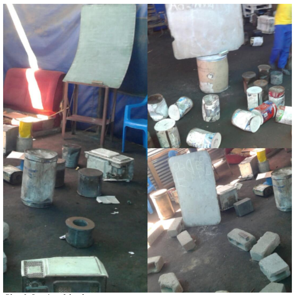
Plate 2: Interior of the classroom