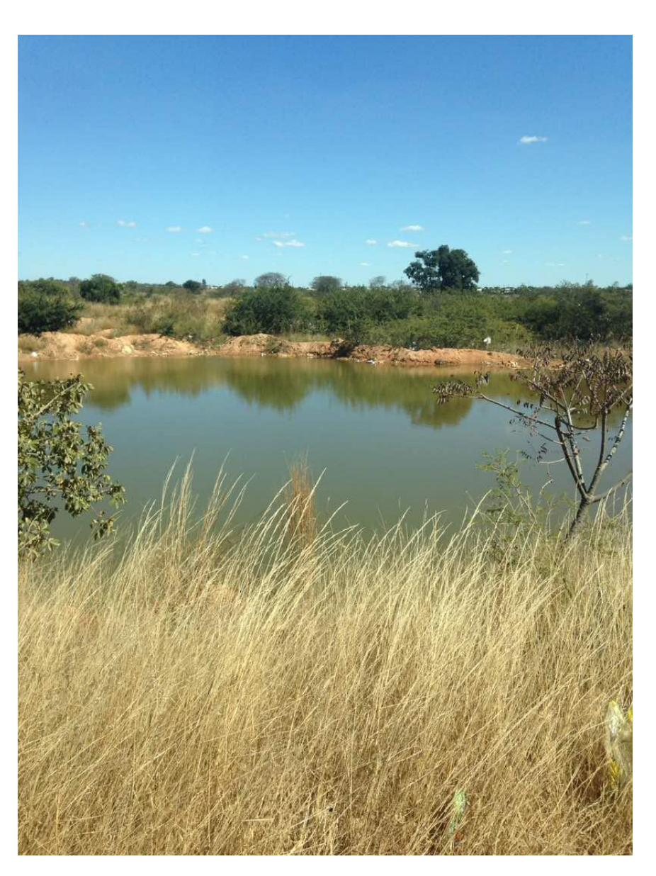
Plate 6: Open pit in Ngozi Mine

Plate 6 shows an open pit which has stagnant water in it and it poses to be a dangerous place as children are likely to drown inside and fuel the outbreak water borne diseases.