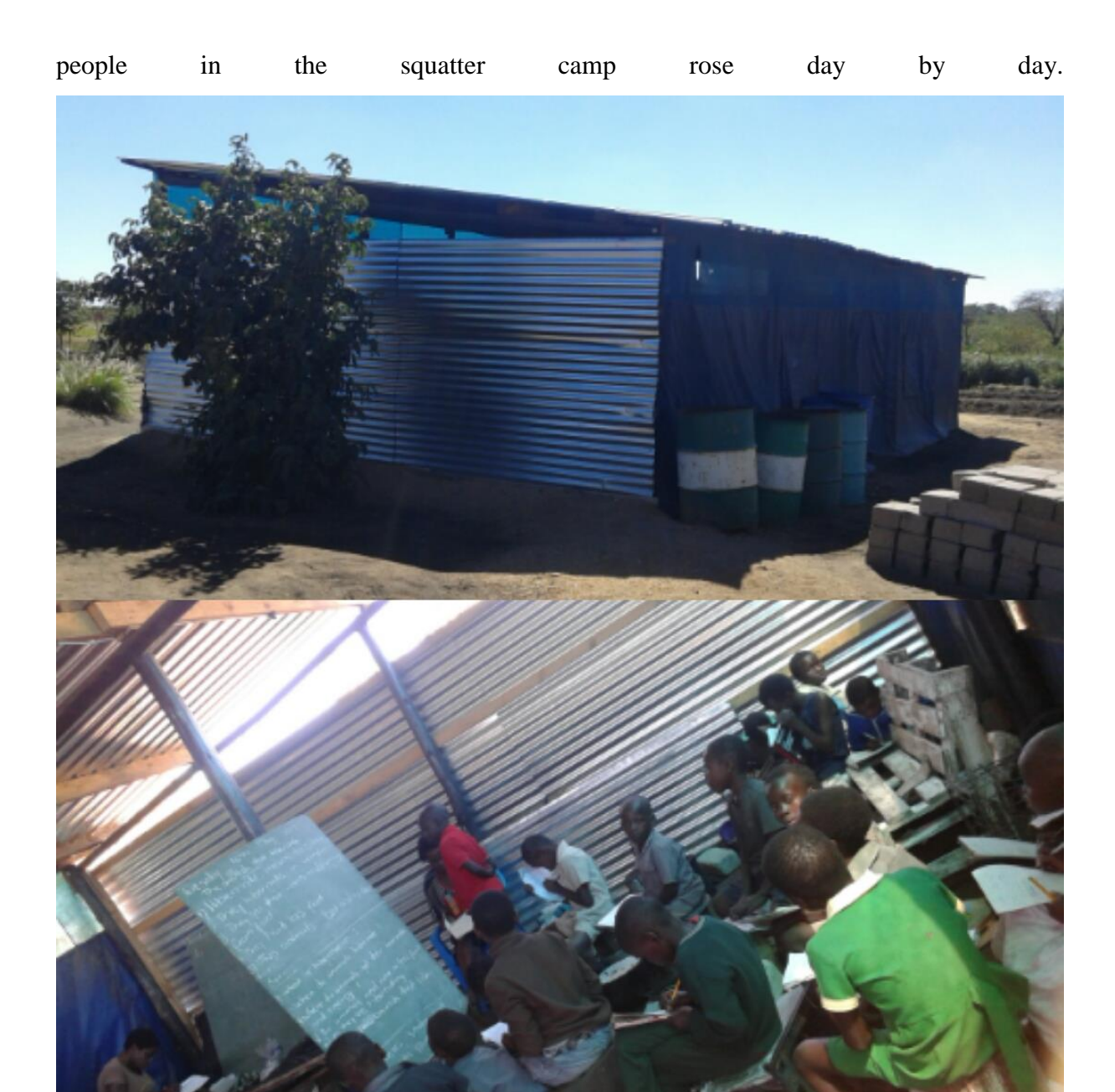
Plate 1: Interior and exterior of a classroom which is also used a church

Plate1 shows the inside of the classroom, there are no classroom furniture, students use cans and stones as schools, and their laps as desks. The school has only 8 teachers who are just doing voluntary work and it should be noted that these teachers are not qualified teachers.