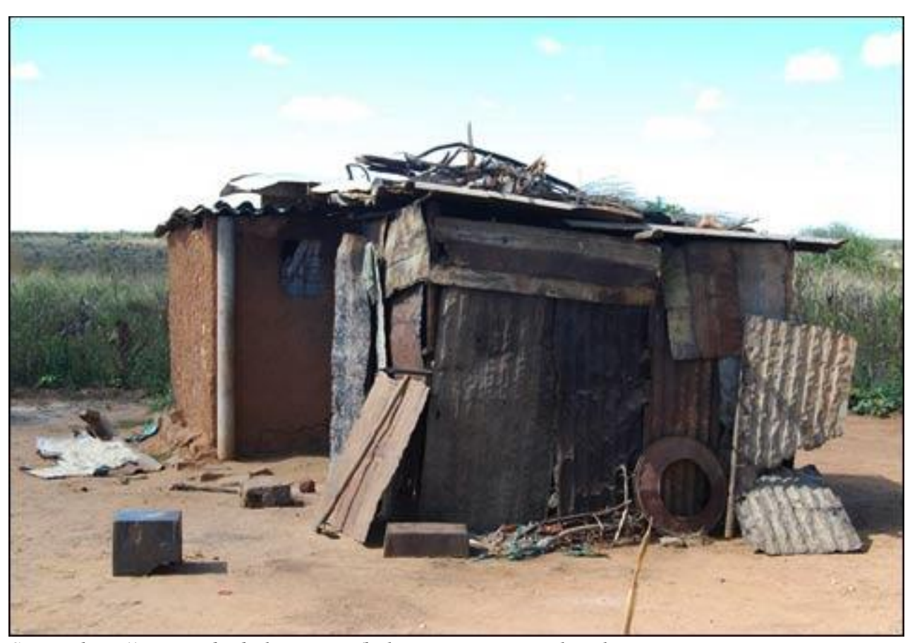
Source: <a href="http://www.radiodialogue.com/bulawayo-city-council-seeks-government-assistance-on/">http://www.radiodialogue.com/bulawayo-city-council-seeks-government-assistance-on/</a>