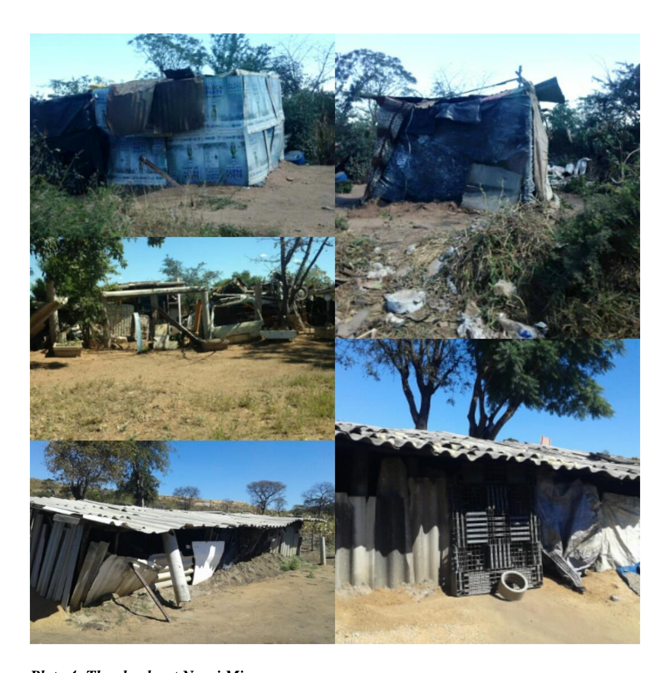
Plate 4: The shacks at Ngozi Mine

Plate 4 shows the houses that the squatters at the Ngozi Mine area reside in. The houses are made of asbestos, plastics and cardboards and this depicts the squalid conditions that the settlers are exposed to.