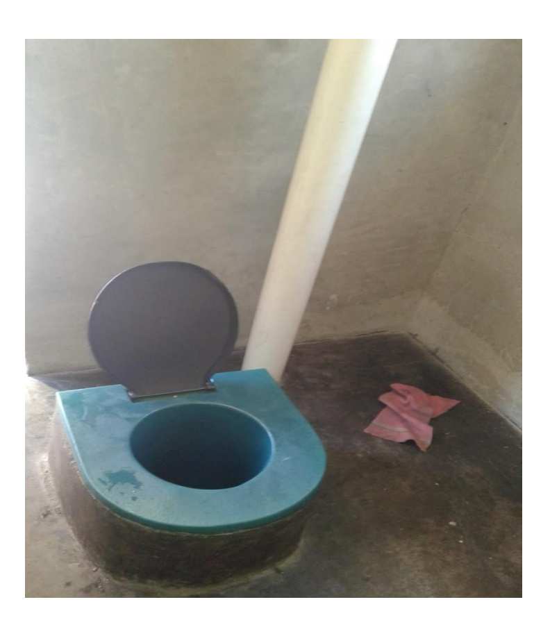
Plate 5: Pit latrine in Ngozi Mine squatter camp.

The inhabitants ranked the inadequate disposal of human excreta second and from the interviews it came to light that they had no standard toilets and some used the open bush system and this poses to be a threat on their health.