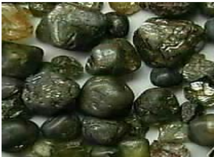
Fig 2: Chiadzwa Diamond Sample

Source: G Mwonzora, “‘Diamond Rush’ and the Relocation of the Chiadzwa Community in Zimbabwe”, MA dissertation, ISS, 2011, p. 20.