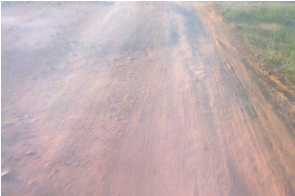
Fig 7: Poor Roads

few facilities in Transau although the houses built in Arda lacks important infrastructure like electricity. The same respondents pointed out that facilities such as roads were very devastating and the companies could not do anything to improve and maintain them. The researcher have observed that the companies ‘heavy trucks worsened the conditions of the dust roads in Chiadzwa. Youths also pointed out the issue of training centres. One young respondent articulated that as young people they were in need of training centres so that they gain adequate skills that would enable them to initiate their own projects .Chiadzwa youths believed that if the mining companies would construct training centres, most of the youths will be able to work for themselves without being engaged in prostitution and smuggling.