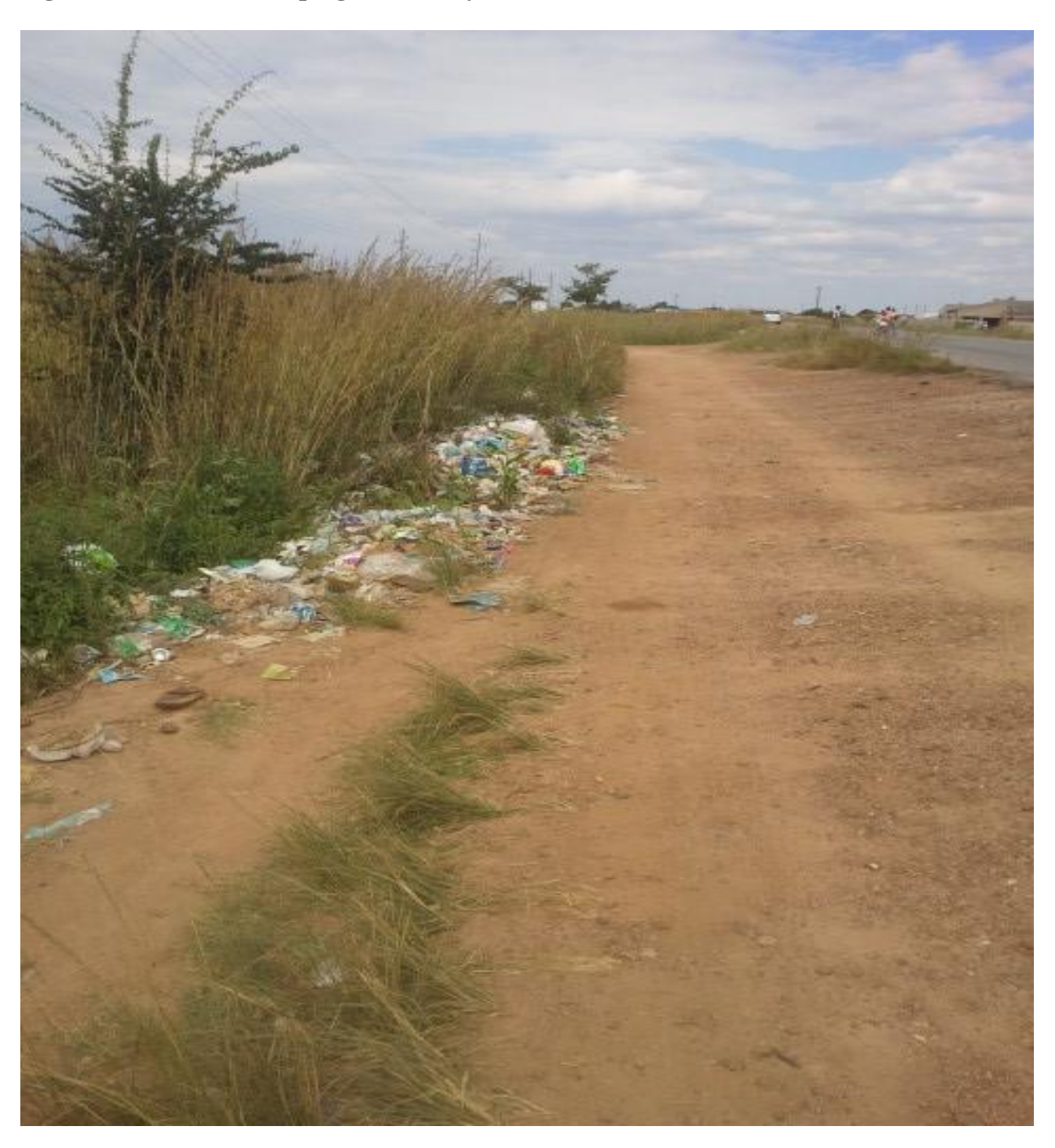
Fig.8. Unauthorized dumping of waste by residents

have uncontrolled and unauthorized dumping sites such as along roads and open spaces as shown on the image below: