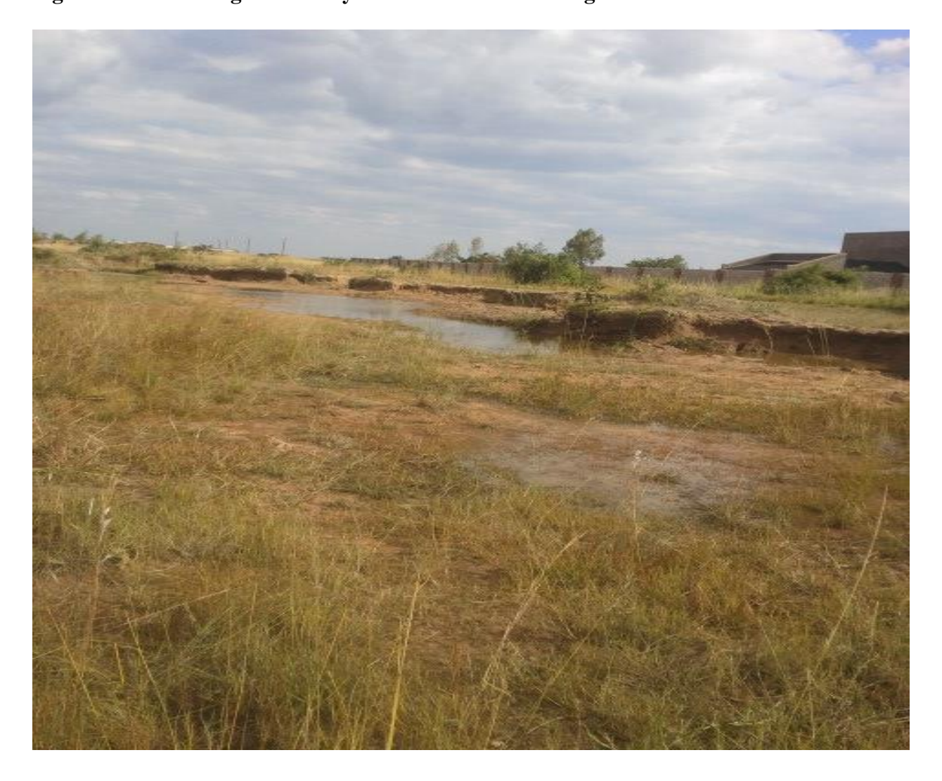
Fig.9. Urban land degradation by commercial sand mining

procedures. Improper mining procedures have left scars within and areas surrounding Chitungwiza environs and many sand extractors have not been moved as they continue looking for new land to dig as shown by the image below: