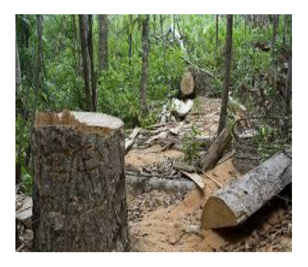
Fig .6.Forest Destruction Due to Urban expansion