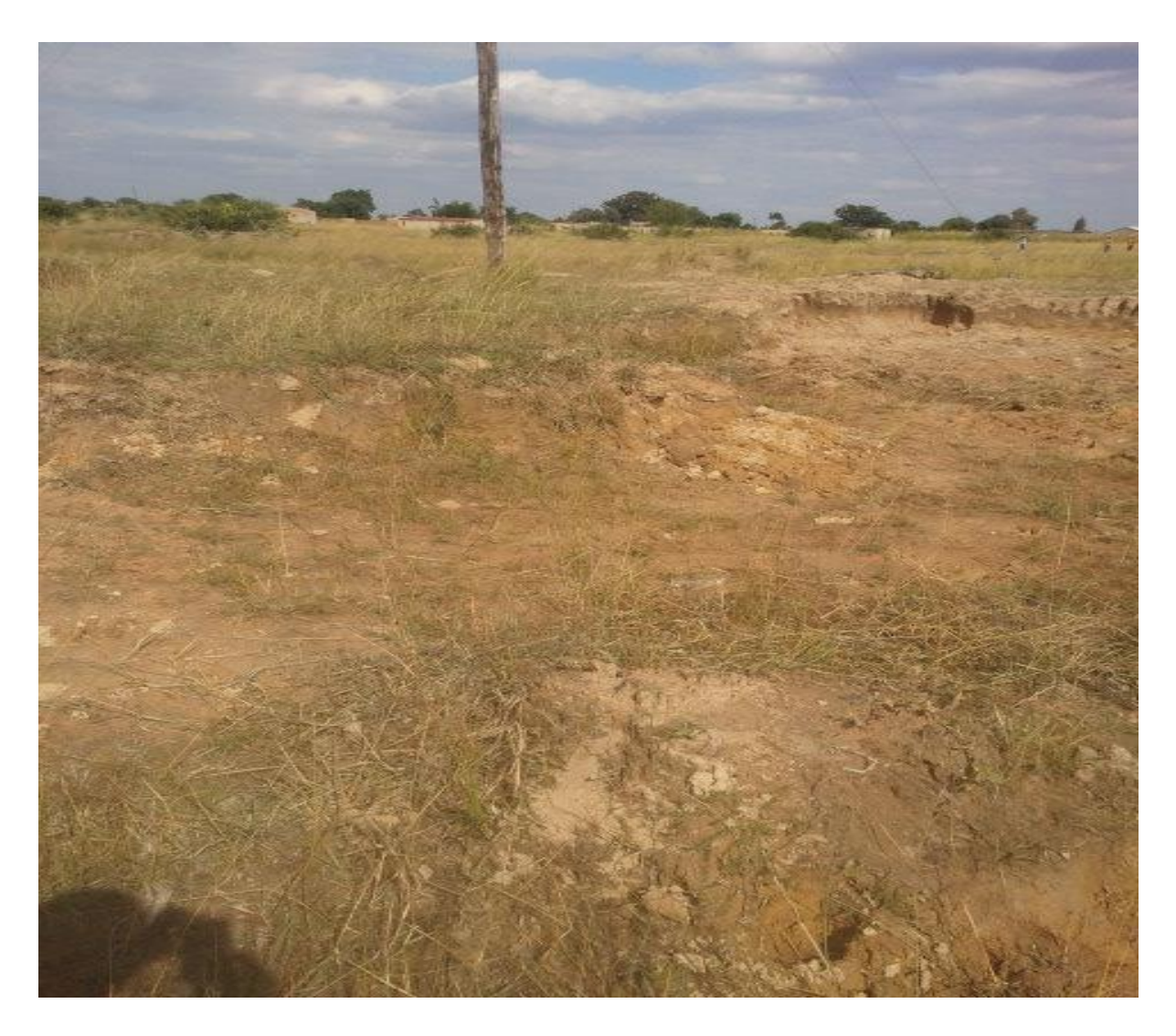
Fig.7. Urban Clearance Paving Way for Residential Development in the periphery of Chitungwiza