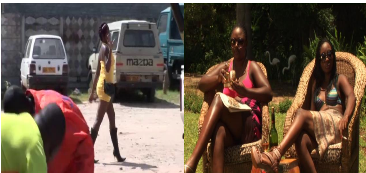
The pictures above shows women in sinners and I want a wedding dress scantily clad