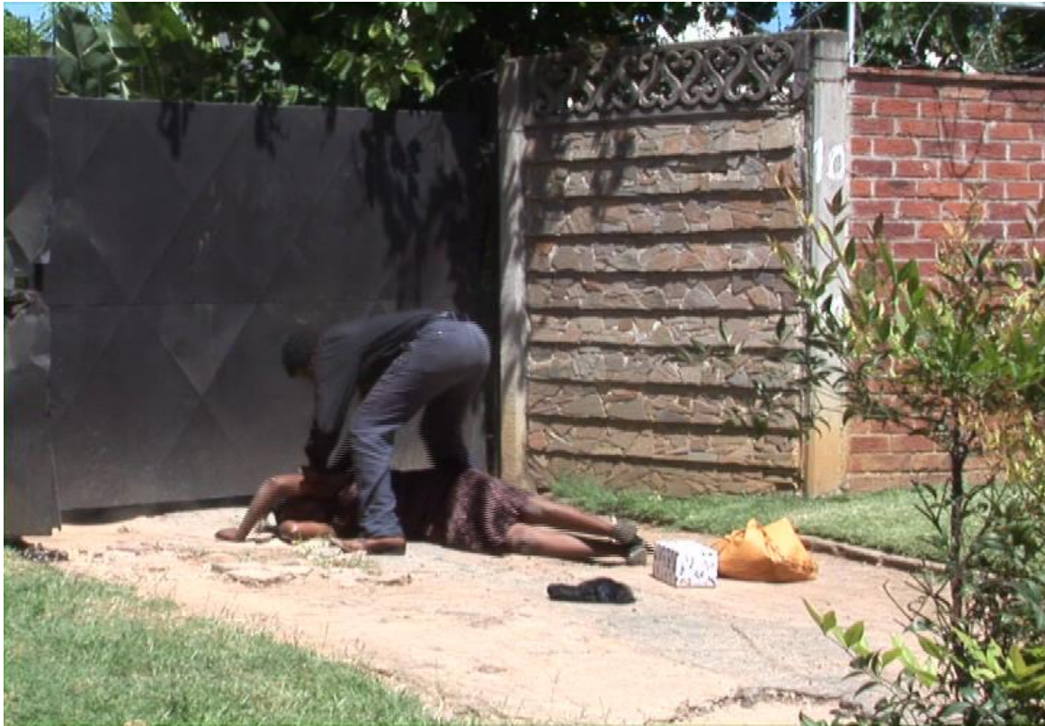
The picture shows Simba in Sinners beating his ex-wife in public

Women are also presented as victims of verbal abuse in these films as they are called all forms of names by men. Mahachi in I want a wedding dress verbally abused Kundi calling her all sorts of names ('...kapfambi kasina musoro...kahure'). Sexual violence is also prevalent in the two films. Women are sexually abused meaning to say they are forced to do sexual things. In Sinners Samantha is forced to have sex with Sekuru Shaya against her will. She is shown in the film struggling to free herself from Sekuru Shaya. In I want a wedding dress Mahachi tries to force his wife to have sex without protection when she wanted protected sex. These representations give men power to trample on women through sexual abuse and violence as they can get away with all these bad acts as shown in the films. In the two films women are abused but not one woman has the courage to report the case to the police.