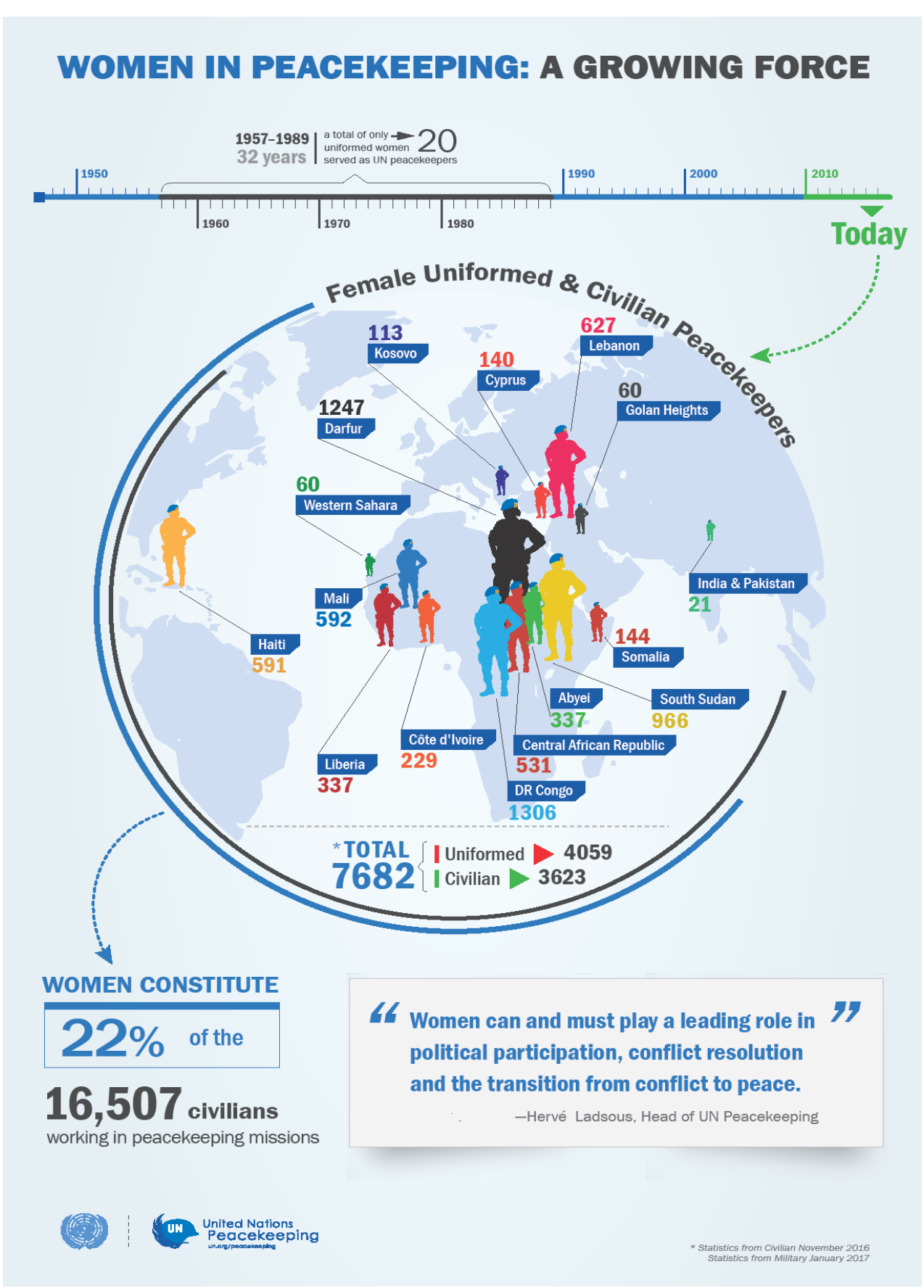
Appendix 1