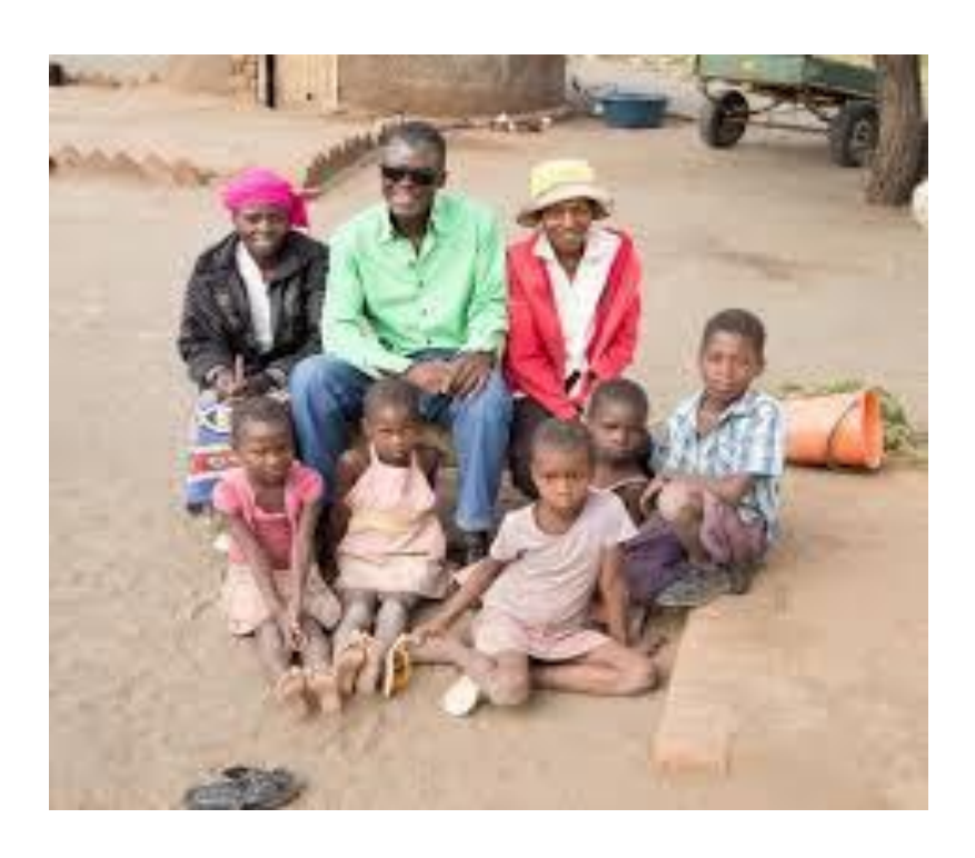
Fig 3. Polygamous chid marriage in Kagweda Village, Mutasa