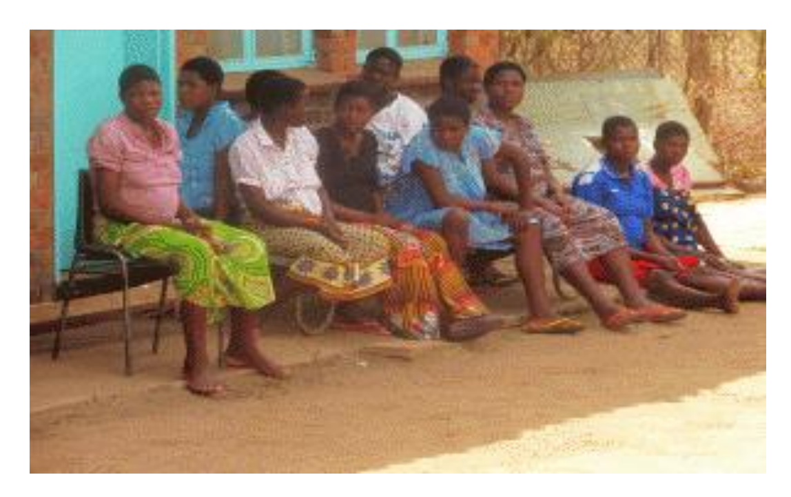
Fig 2.Expecting young mothers at Hauna RDC Clinic in Mutasa

Young girls particularly those below 15 years of age face serious reproductive health hazards sometimes losing their lives as a result of early pregnancies. If a mother is under the age of 18, her infant's risk of dying in its first year of life is 60 per cent greater than that of an infant born to a mother older than 19 (UNICEF, 2009). The complications that occur during pregnancy as well as giving birth may also result in the premature birth of the child, low growth rate, poor mental and physical growth of the child. Along similar lines, Svanemyr et. al (2012) postulates that studies indicate that a child from an under-aged mother has 40 per cent less chance of surviving during the child's first year.