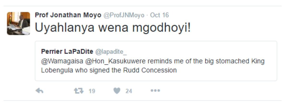
Figure 3.1 an example of uncivil words

The tweet in fig generated nineteen retweets and twenty-four likes. This means the tweet was rebroadcast to followers of nineteen different twitter profiles, this means of the nineteen profiles that retweeted, if in case each profile has a thousand followers, these all have the potential to see the message and even retweet it to their followers. The nodes of where the tweet can reach are just unimaginable.