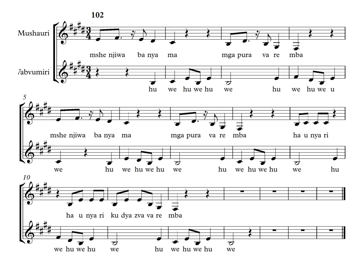
Song 7 (song transcribed by Takudzwa Matata and Leah Rusero)

Lyrical Content of the song (song transcribed from tape to words by Leah Rusero)