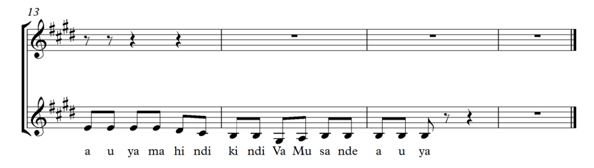
Song 6 (song transcribed by Takudzwa Matata and Leah Rusero)