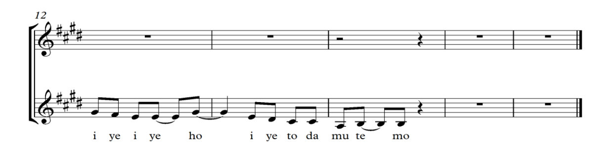
Song 1 (transcribed by Takudzwa Matata and Leah Rusero)

I also transcribed the song from tape to word and conducted a literal analysis so that readers who do not understand Shona language would also be able to read it in English.