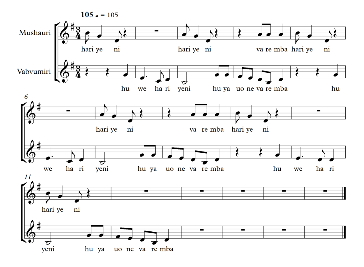
Song 5 (Song transcribed by Takudzwa Matata and Leah Rusero)

The song Harieni was also transcribed from tape to words below