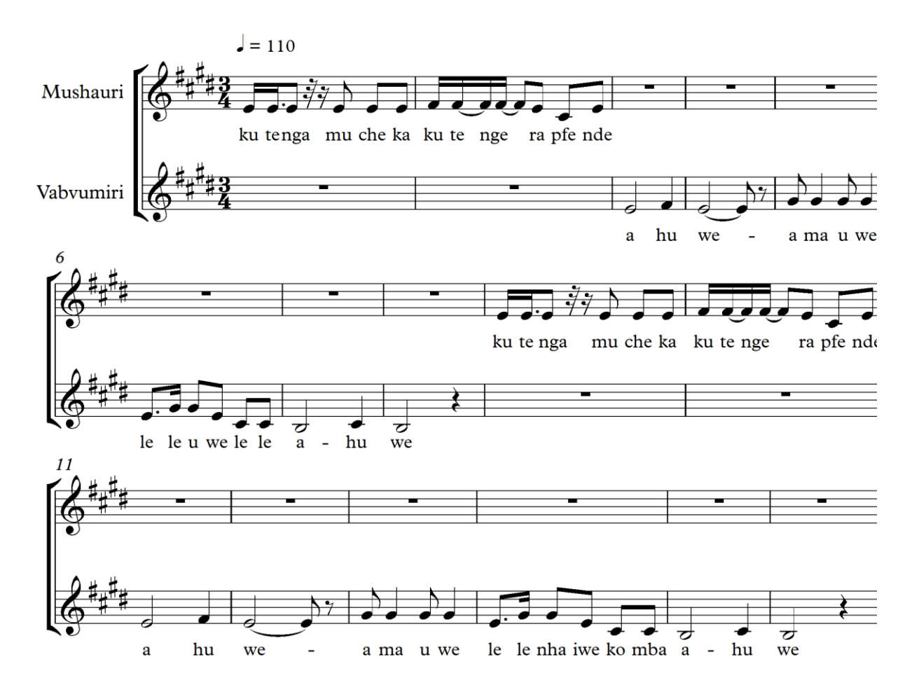
Song 3 (song transcribed by Takudzwa Matata and Leah Rusero)