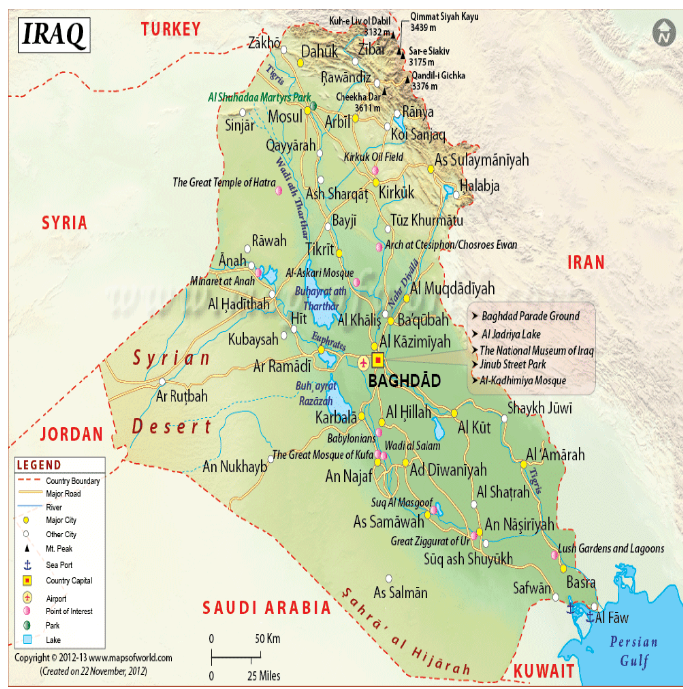
Appendix 1: Iraq Map

Source: http://www.mapsofworld.com/iraq/maps/iraq-map.gif(accessed 1 May 2015)