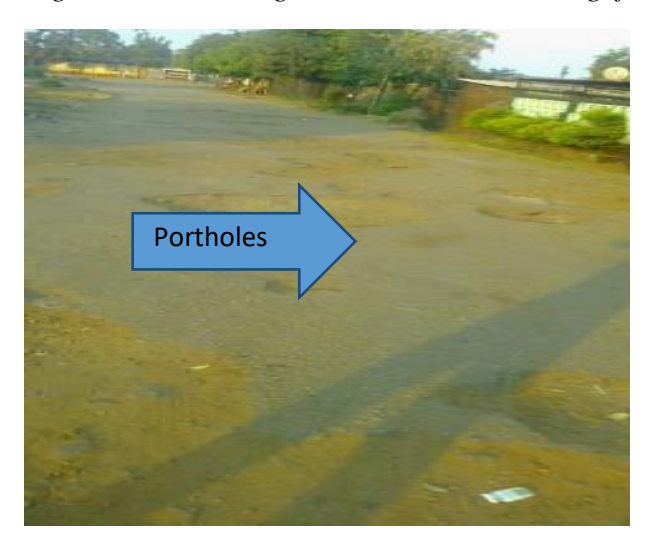
Figure 6, crumbling roads in Harare, in Highfield high density suburb, 2015

inhibited by lack of financing. Consequently, traffic congestion especially during peak hours, inadequate public transport, crumbling roads (figure6) become the norm in the day to day transport service in Harare.