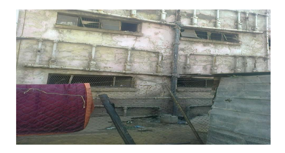
Figure 2) Poor housing conditions in Matapi Flats, Mbare 2015

the urban poor. Poor living conditions, overcrowding, poverty, lack of access to clean water and sanitation has been associated with the frequency of diseases such as Malaria, Typhoid and Diarrhea. It has been argued that less than 50% of the urban population in Harare has access to clean water (National Water and Sanitation Inventory, 2009). Above all, these conditions make women and girls susceptible to sexual abuse, sexually transmitted diseases, child marriages and unwanted pregnancies hence withdrawing affirmative action to achieve women empowerment