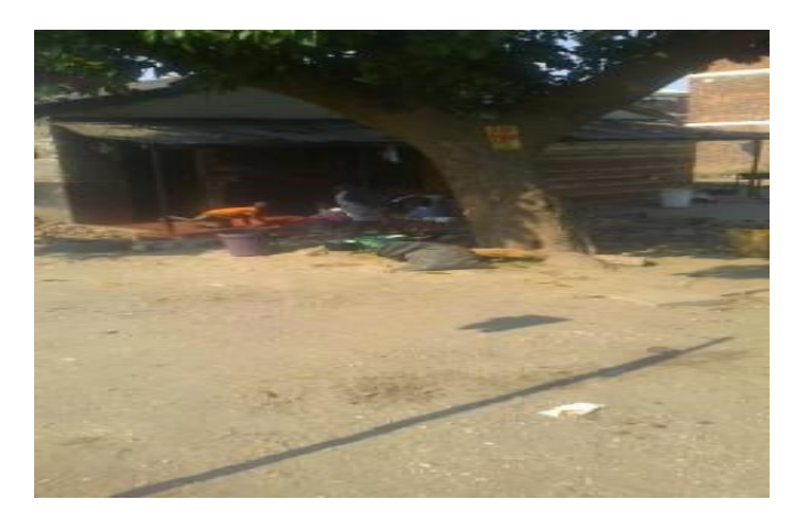
Figure 3 poor housing standards in Mbare, 2015