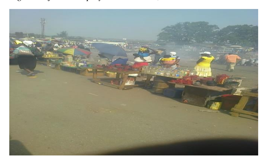
Figure 7Informal employment in Mbare, 2015