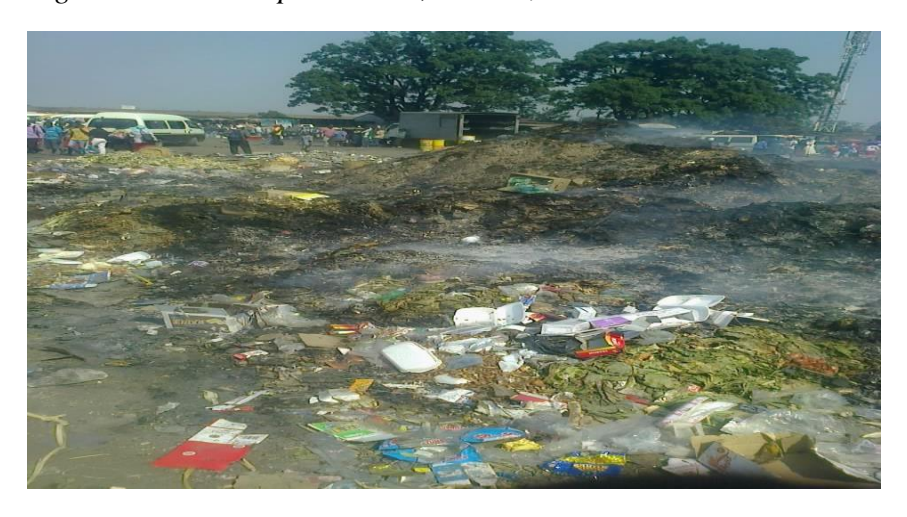
Figure 5Waste dump in Mbare, Harare, 2015

led to people dumping in open spaces along the streets as shown by the streets of Mbare suburb in Harare.