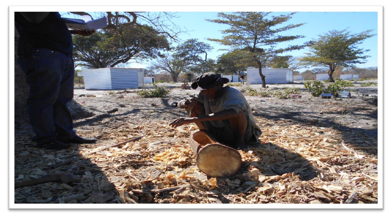
FIG 1: The picture above shows a san man at Oshandi working on the craft for an Owambo person and he complained of the unfair trade that takes place between them and the owambo people.