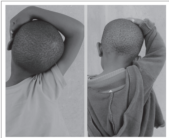
FIGURE 1: Children demonstrating the 'clutch-the-ear' and get enrolled practice.