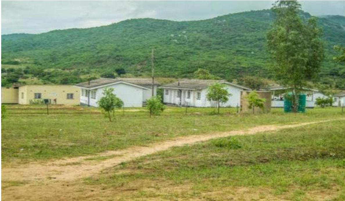
FIG 3. Morden electrified brick houses in Chipfatsura Communal Area, under Chief Zimunya.