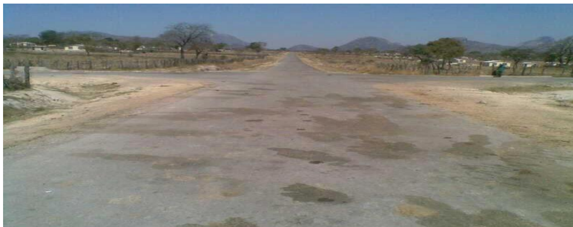
FIG 2: This image shows a road connecting the busy areas in Gwindingwi Growth Point and the Business Center at Zhangazhe.