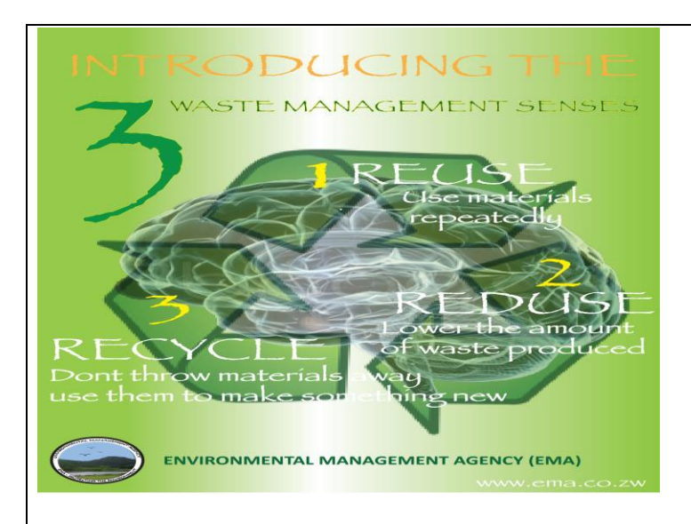
Fig 5: Waste Management