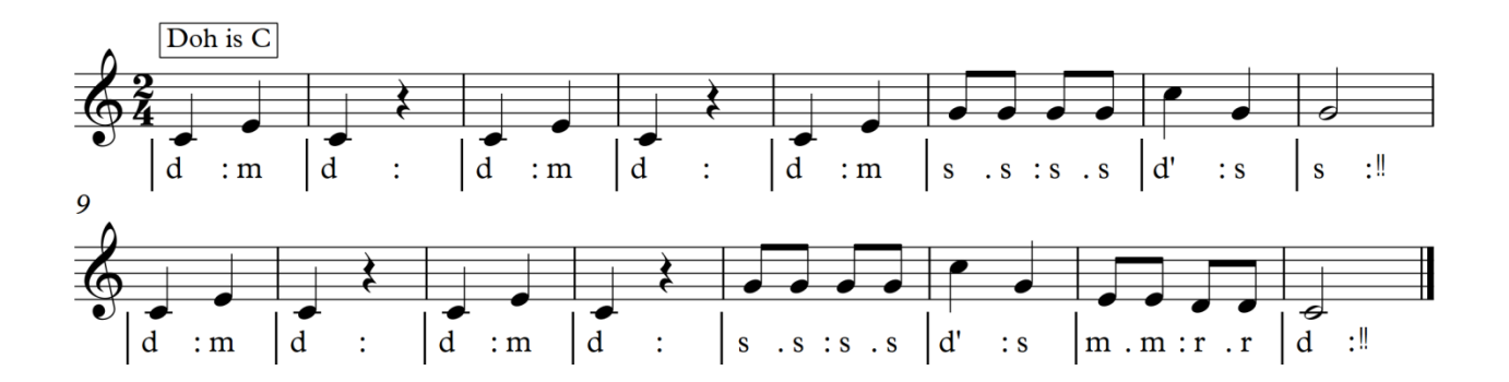
Song 3: Kambudzi(Transcribed by author)

The song talks about a goat that is playing alone on top of an anthill. This is also a short song that that is suitable for use in this level. The intervals range from unison to a fifth. Bars 1-4 and bars 9-12 have exactly the same rhythm and pitch. The G, the E and D unison notes are easy notes put on a running rhythm for tempo variation.