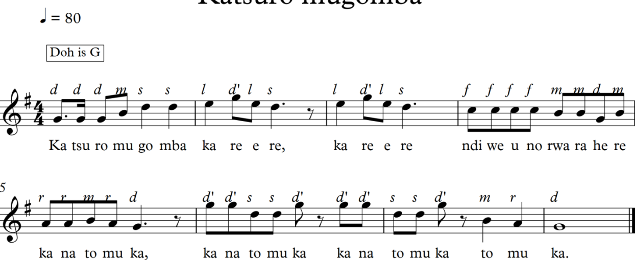
Song 14: Katsuro mugomba (Transcribed by author)

The song talks about a hare sleeping in a pit. It introduces the pinched noteds on recorder, upper G as well as the whole note.