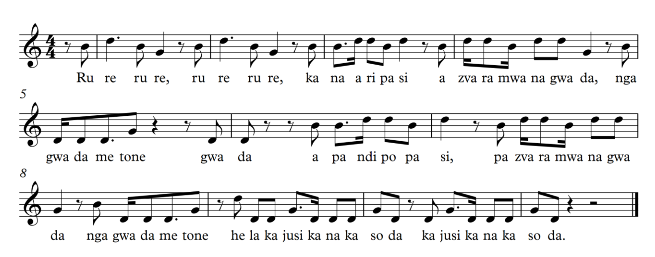
Song 13: Rure rure (Transcribed by author)

The song introduces the crotchet and quaver rests. At this level the students are now taught the actual duration of periodic silence in music. These rests are taught through singing the lyrics. The complicated quaver and semiquaver rhythms here are taught via singing the song before playing it on recorder. This piece is used here for ear training of the students.