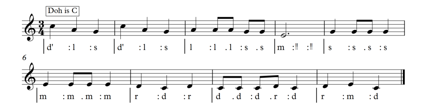
Song 1: Bantwana. (Trasncribed by author)

This is a song about children and hyenas. The leader is calling the children to come home. The children are afraid because there are hyenas around but the leader assures them that there are no longer any hyenas. The song uses simple walking notes(crotchets). The intervals between notes are not more that a 3<sup>rd</sup> apart. The inclusion of the few running notes will make children enjoy