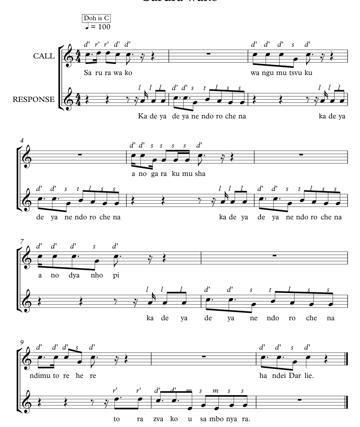
Song 16: Sarura wakho (Transcribed by author)

Sarura wako is a song that talks about choosing your partner. It empasises the need to have proper relationships between opposite sex. The song is a call response piece that is arranged here