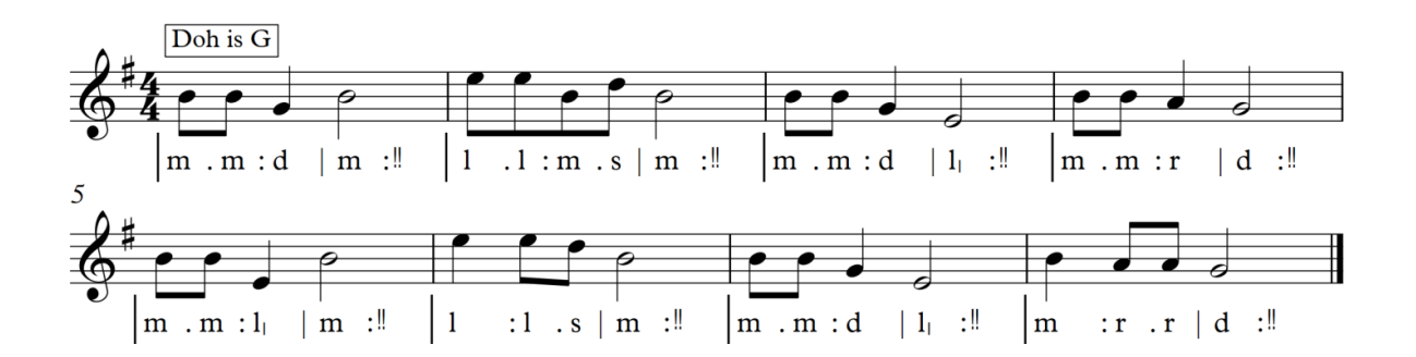
Song 6: Umangoye lo Gundwane(transcribed by author)

The song talks about a cat stalking and catching rats. It uses G major key. The intervals range from unison to a 6^{th} . The song is suitable at this level as it has leaps that train finger flexibility.