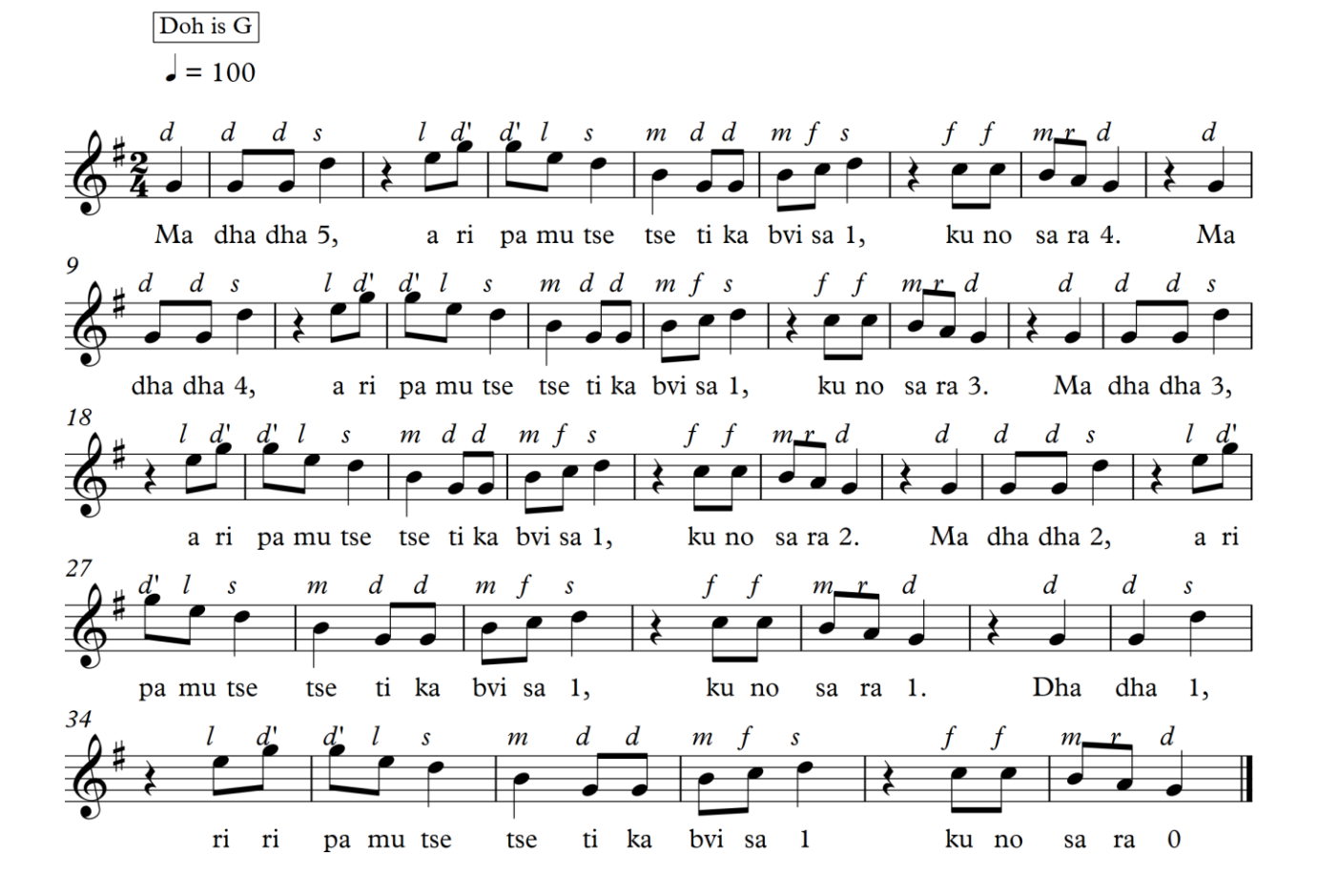
Song 15: Madhadha aripamutsetse (Trascribed by author)

This song talks about ducks in a line. It's a counting song that reinforces mathematical concepts. At this level children are now playing the recorder in small ensembles. The lyrics are sung by a smaller group while the rest play the recorder. At this level intervals of up to an octave have been mastered.