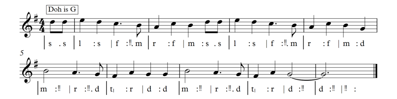
Song 12: Kukuluku (Transcribed by author)

This song talks about animal sound. Kukuluku is the sound made by chickens. The songs main purpose of inclusion in this group is to reinforce the dotted crotchet rhythm as well as introduce a tie in music. Tonic solfa notes are returned so as to see the relationship between the tie and the solfage.