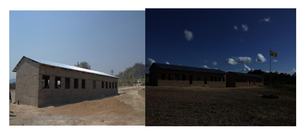
Fig 7: Zibwowa secondary school in ward 20.

disagreeing basing on the fact that the land was too small. Through the ECLF peace building skills and the hard work done, today the community is full of joy because of the secondary school in ward 20, and the school has already enrolled students from the local community. It is now easy for the children and the community at large to educate their children. Through such a step forward, Zibwowa Development Association were impressed by this and are still working hard towards getting the access to electricity for both the primary and the secondary schools.