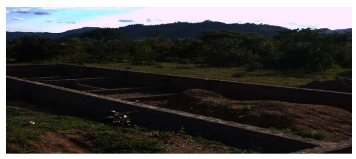
Fig 8: Above is Chiromo clinic under construction in ward 8, Image source: ECLF 2016

Significantly, there is also the construction of a clinic in Chiromo ward 8 in Zaka, which is 40 km away from Jerera growth point. Together with the community, the LPCs came up with an idea to build a clinic after the ECLF's work in Zaka. The vision which has been blocked for so long, has actually come into light through hard labor, working together and the contribution from different stakeholders. The current situation shows that the clinic project is at the slab level.