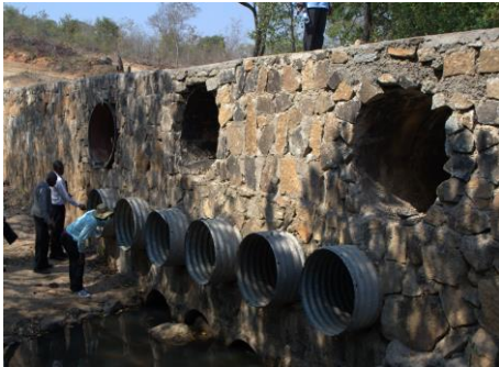
Fig 6: A nearly complete Rwemhepo Bridge in ward 5, (picture taken 12 May 2017)

Besides the construction of the bridge, the community members have also managed to put their heads together and construct a two block secondary school in Zibwowa, ward 20, 20km from Jerera growth point. This secondary school has become a success because of the unity and through income generating projects. Long back, school children would walk about 7km away and this was regarded as their nearest school. Since there was division for the past couple of years, mobilizing community members was not that easy and on the other side the council was