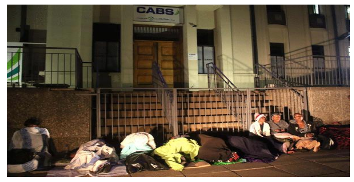
Figure: 1 Show pictures of Zimbabweans struggling to withdraw their money from the bank, with some sleeping at the bank. Some banks have imposed withdrawal limits as little as $20 per day. Picture by Tsvangirayi Mukwazhi. Newsday 24 January 2017.