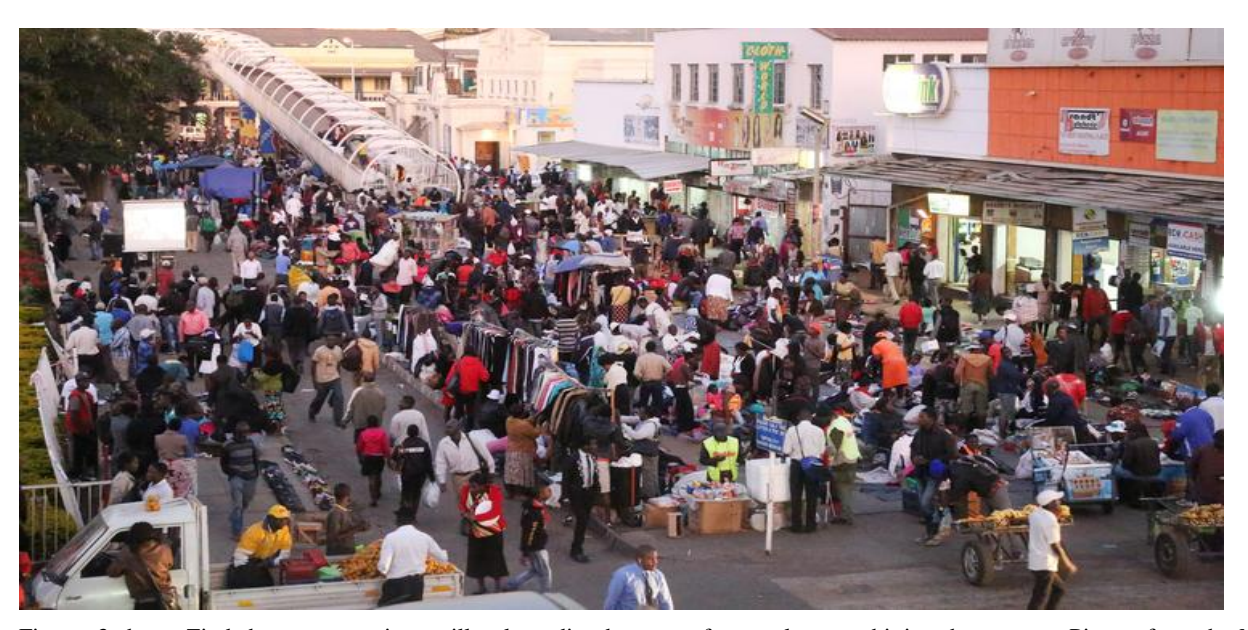
Figure: 3 shows Zimbabweans resorting to illegal vending because of unemployment hitting the country.

The government did not provide enough houses for the affected people but it also encouraged those affected to go back to their villages and live there (Mupandawana, 2013). The high rate of unemployment and the high rate of urban migration therefore increased the rate of poverty as it resulted in house shortages and increased urban unemployment. This is the main reason why there are so many people who are involved in street vending trying to make ends meet through selling goods like vegetables, airtime, newspapers and pirated videos (UN, 2014).