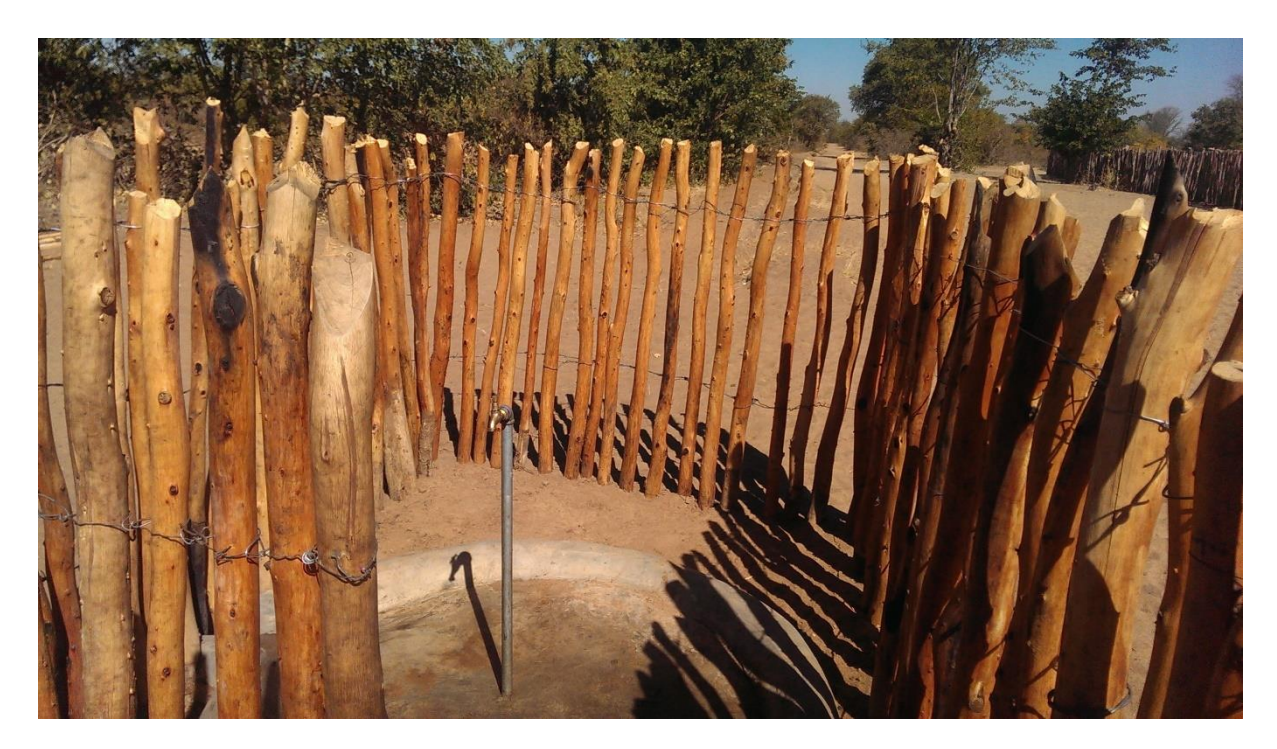
(fig 3 A functional tap under piped water scheme at Gulalikabili Village ward 7) by Nomthandazo Ndlovu March 12, 2016)

Moloi said that the community is very happy as they are going to benefit a lot and will not have to travel kilometres to find water and they are using taps which are easier and convenient to use than boreholes.<sup>46</sup>