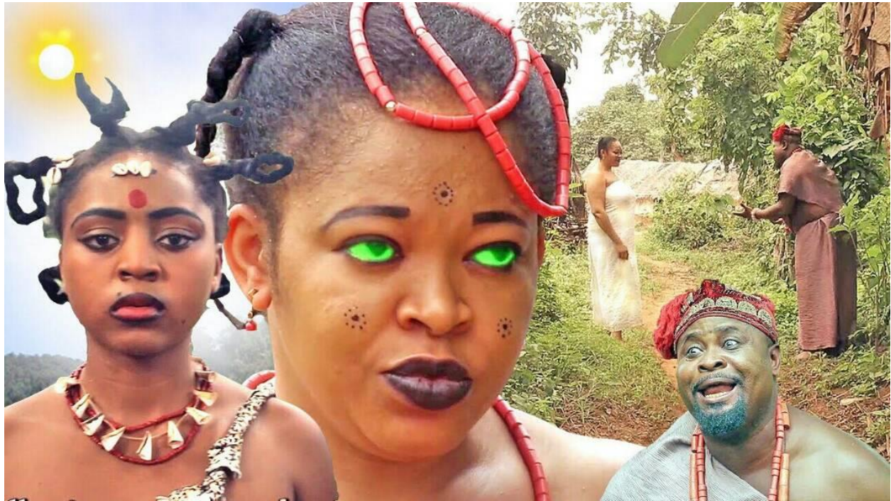
Fig 8: Nigerian character make-up

consists of black liners and lipstick together with red, which in some cases symbolises danger or evilness in a character. The image below is an example of makeup in this genre of films.