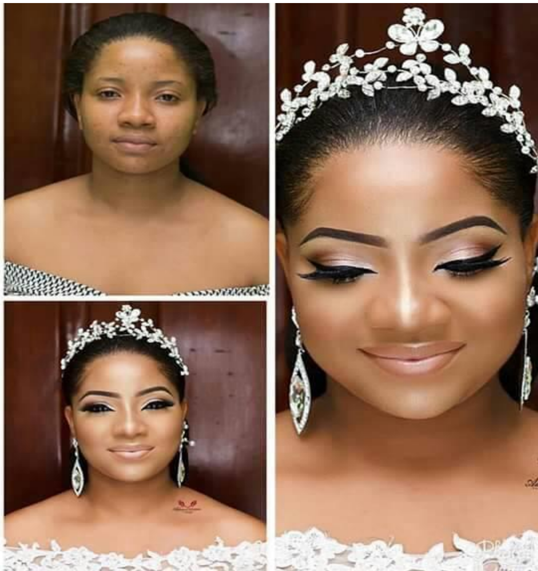
Fig 2: corrective make-up

Below is an example of the corrective type of makeup which emphasizes the facial features. This type of makeup is mostly common in women from all over the world, some on a daily bases some occasionally for example a bride on her wedding day.