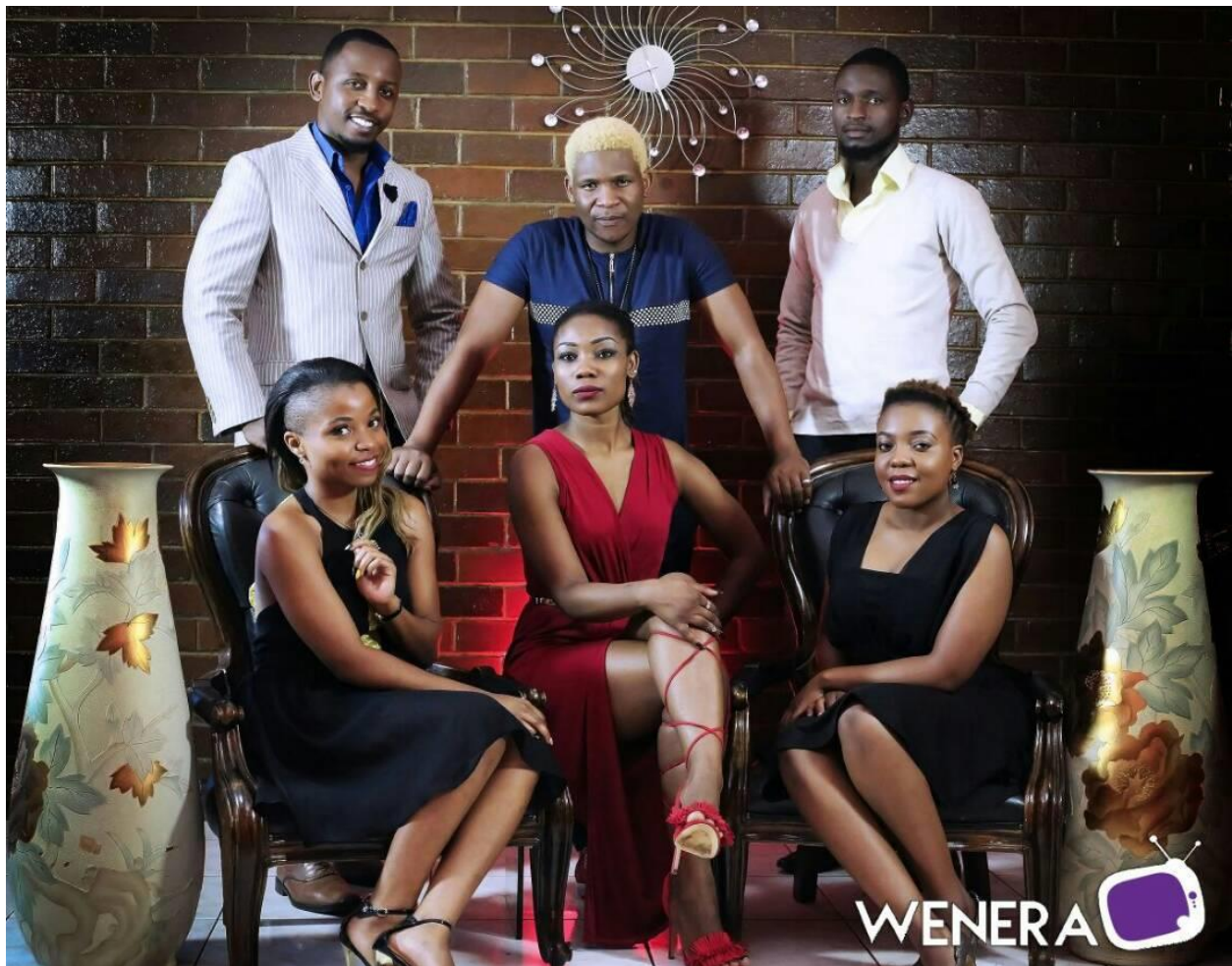
Fig 9: Wenera cast makeup

Makeup is very important in character building in any film productions for example in a soap operas like Wenera. As a makeup artist I had to be very prompt in everything, making sure every actor or actress is ready for their scenes. This required me to be at work first before the cast, as well as have a call sheet to know the cast on call for the day as well as scene outlines so as to know the type of makeup required, if it needs more research or ingredients.