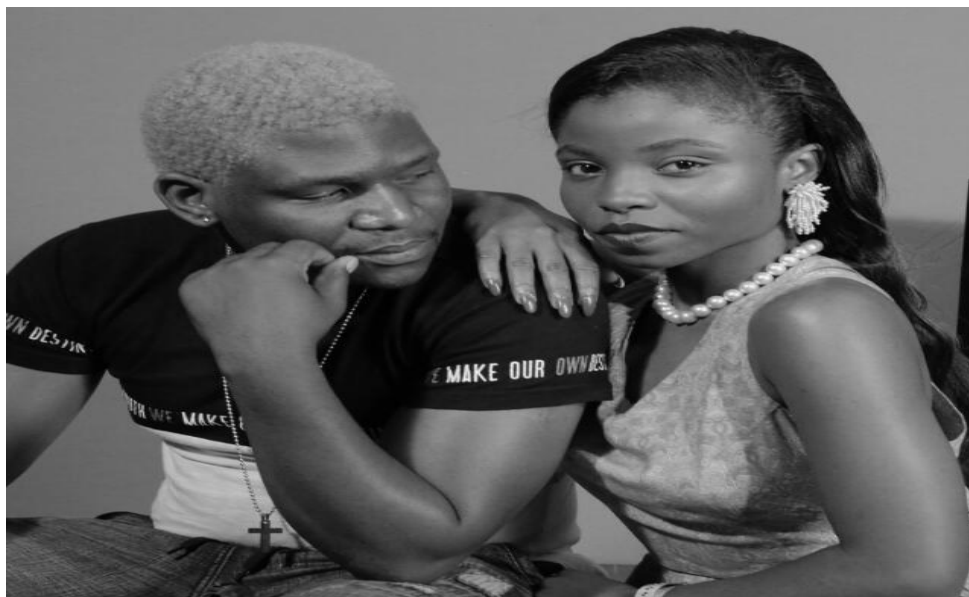
Fig 11: character make-up on "tsotsi and gugu"

Below is an image of "Tsotsi and Gugu" ,and the type makeup that influences their characters.