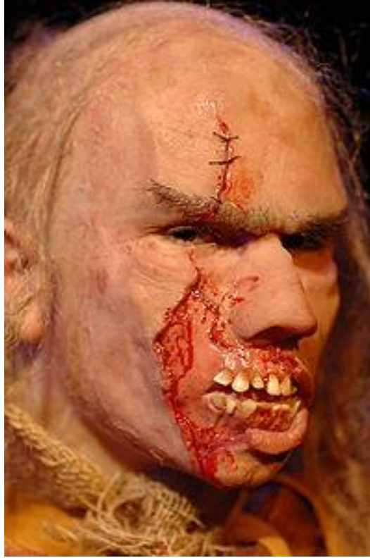
Fig 5: prosthetic make-up

The process of creating a prosthetic appliance begins with life casting, the process of taking a mold of a body part (often the face) to use as a base for sculpting the prosthetic. Life cast molds are made from prosthetic alginate or more recently, from skin-safe silicone rubber. This initial mold is relatively weak and flexible. A hard mother mold, typically made of plaster or fiberglass bandages is created overtop the initial mold to provide support.