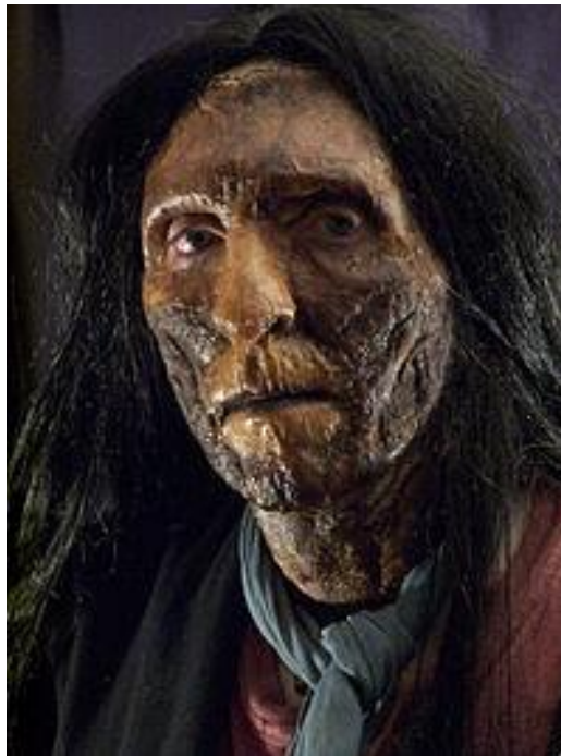
Fig 4: prosthetic makeup

It is also called (Special effects makeup and FX prosthesis) is the process of using prosthetic sculpting, molding and casting techniques to create advanced cosmetic effects. Prosthetic makeup was revolutionized by John Chambers in such films as Planet of the Apes and Dick Smith in Little Big Man