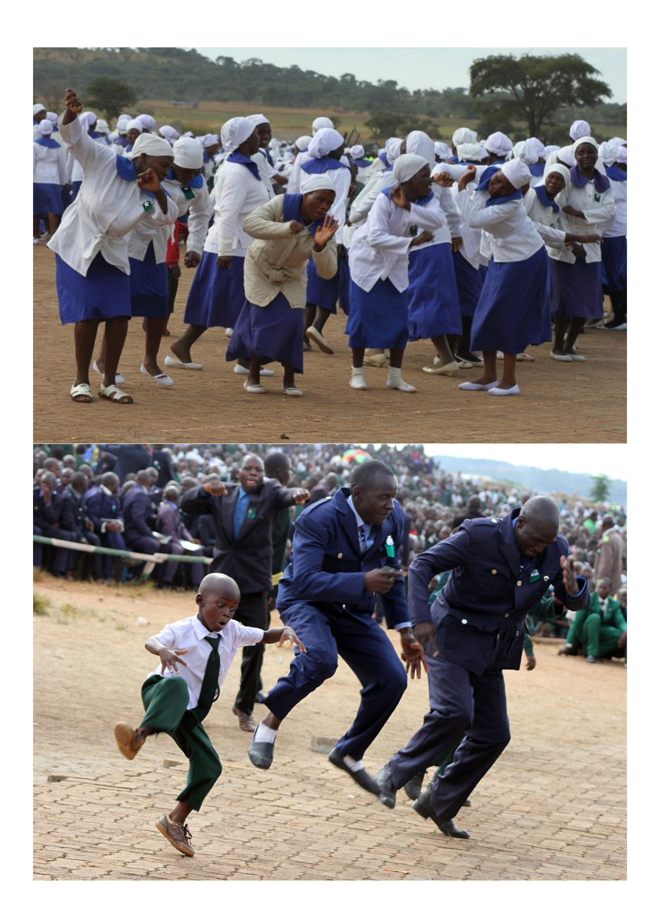
Fig 3. A uniform brings oneness in the ZCC while dancing makes the church 's way of religious expression more live and vivid.