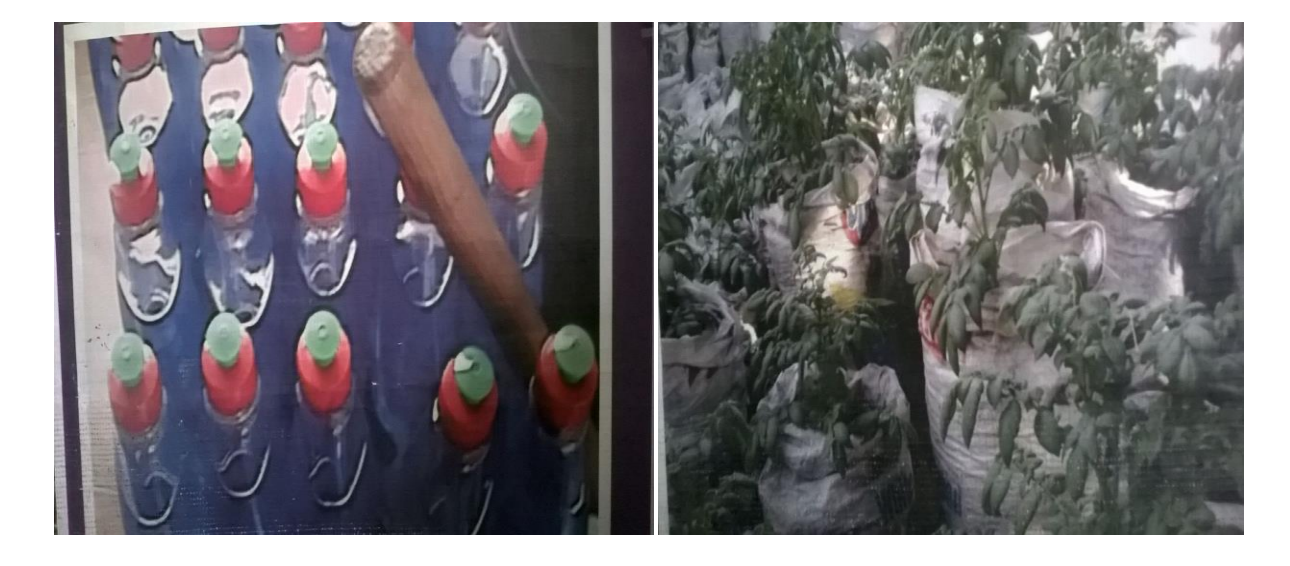
Image 6Source primary data 2016: Detergents making and potato farming

From the focus group, the researcher observed that DWYT has changed the people's lives. The responded from focus group discussion emphasized the establishment of DWEYT as a welcome of women to development discourse and to be self-sufficient through projects and trainings