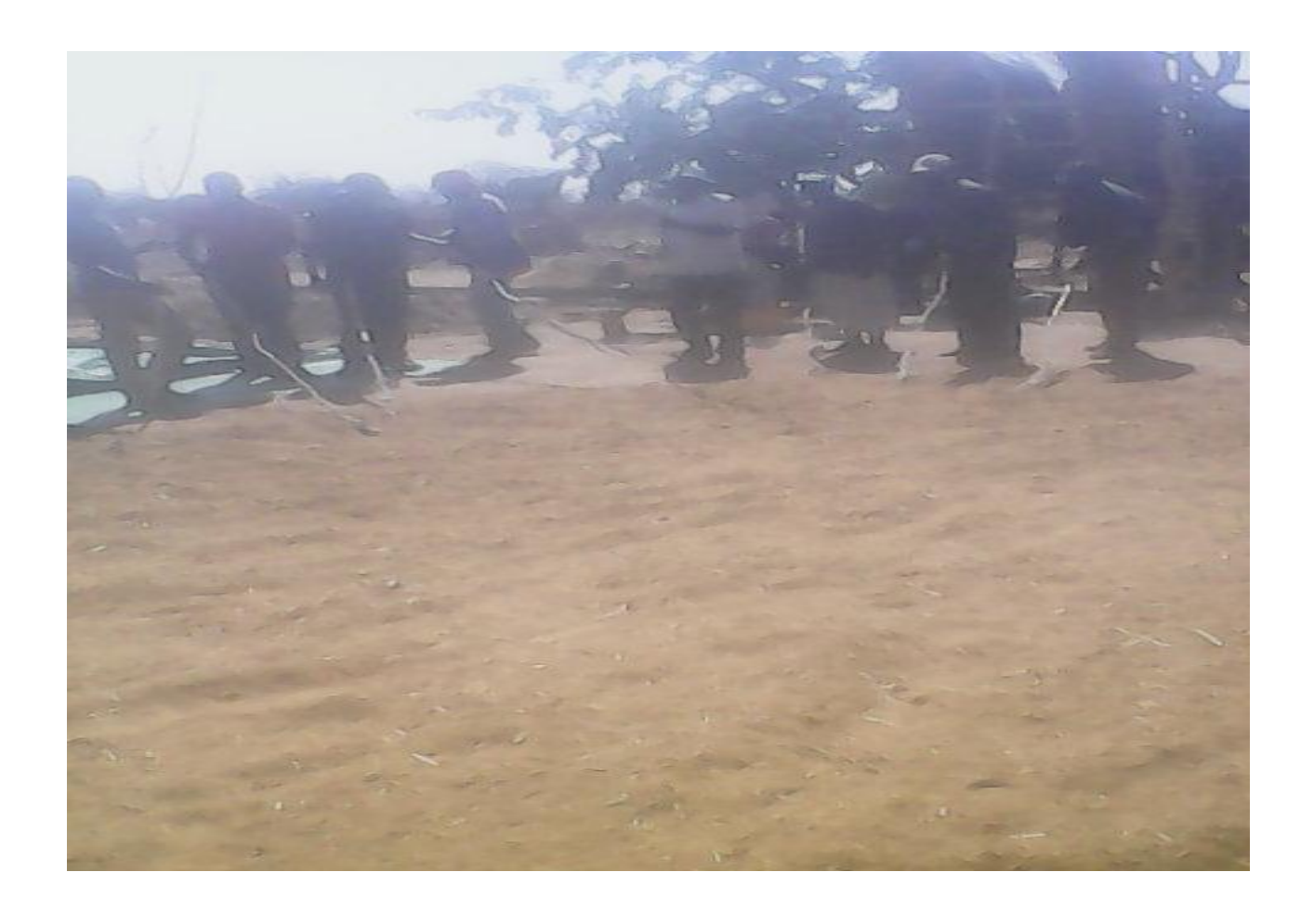
Fig. 1 showing Karanga people of Dorset Area preparing to thresh grain