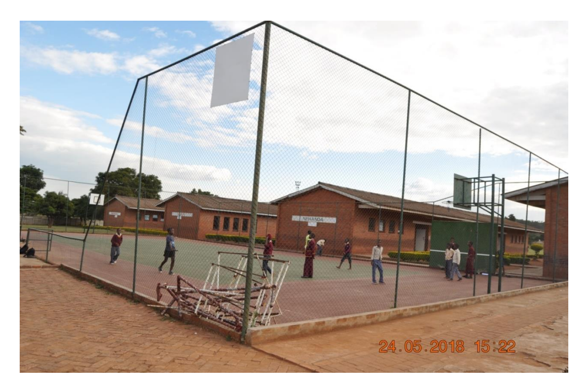
Figure 4: Multipurpose Court