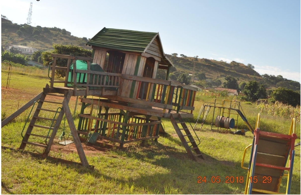
Figure 3 : ECD Play centre