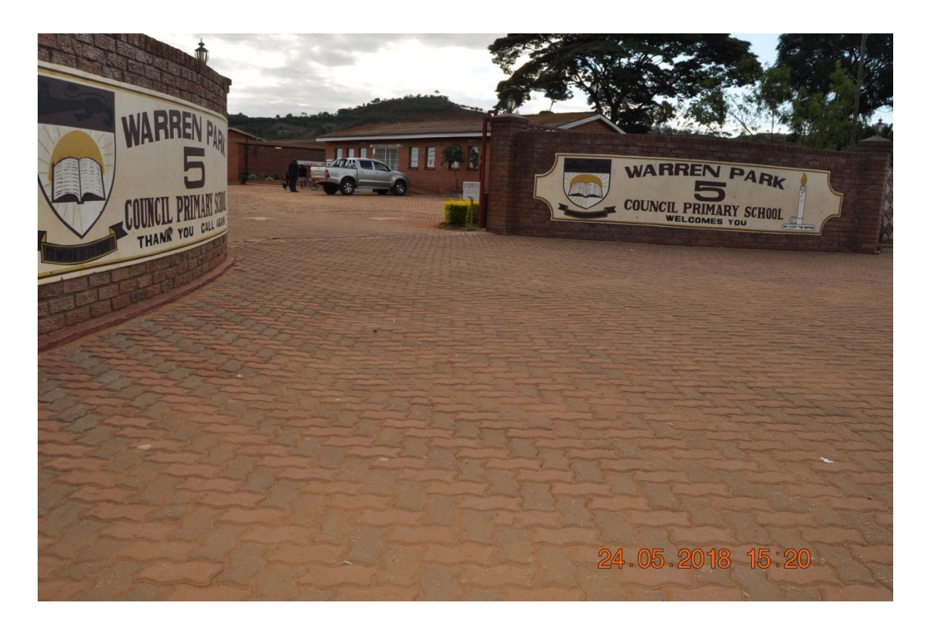
Figure6 : Paved school yard