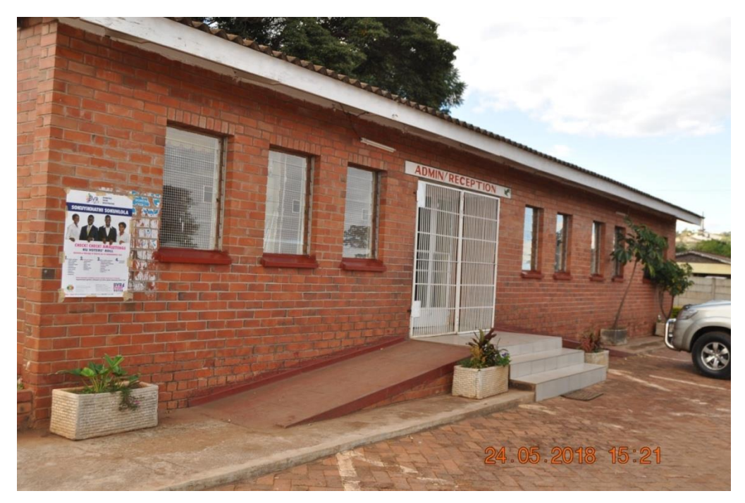
Figure 2 : Administration Block