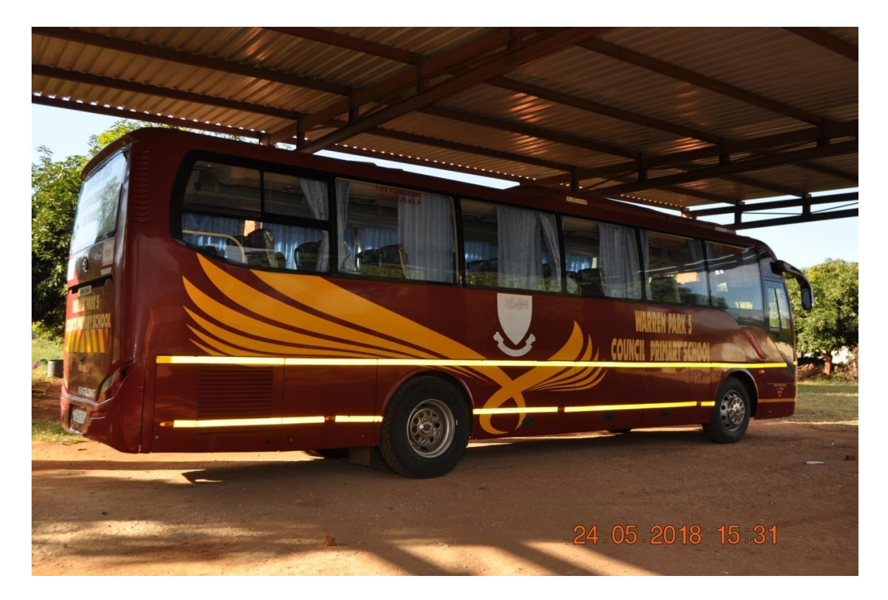
Figure 7: School Resource

milestone achievement in the updated curriculum. Some respondents highlighted the issue of donations helping them a lot. Donations have been spelt out by Mutseyekwa(2010) and he clarifies that UNICEF donated books in 2010 to alleviate textbook shortage. There was evidence that three of the schools under study namelyChaminuka,Kaguvi and Nehanda had bought photocopier machines. The SDC at Chaminuka has sourced a swipe machine for easy payment of fees. All the four schools under study highly appreciated the provision of transport in the form of buses and mini-buses with Chaminuka having a very big bus, which carries 50 passengers as shown in the picture below.