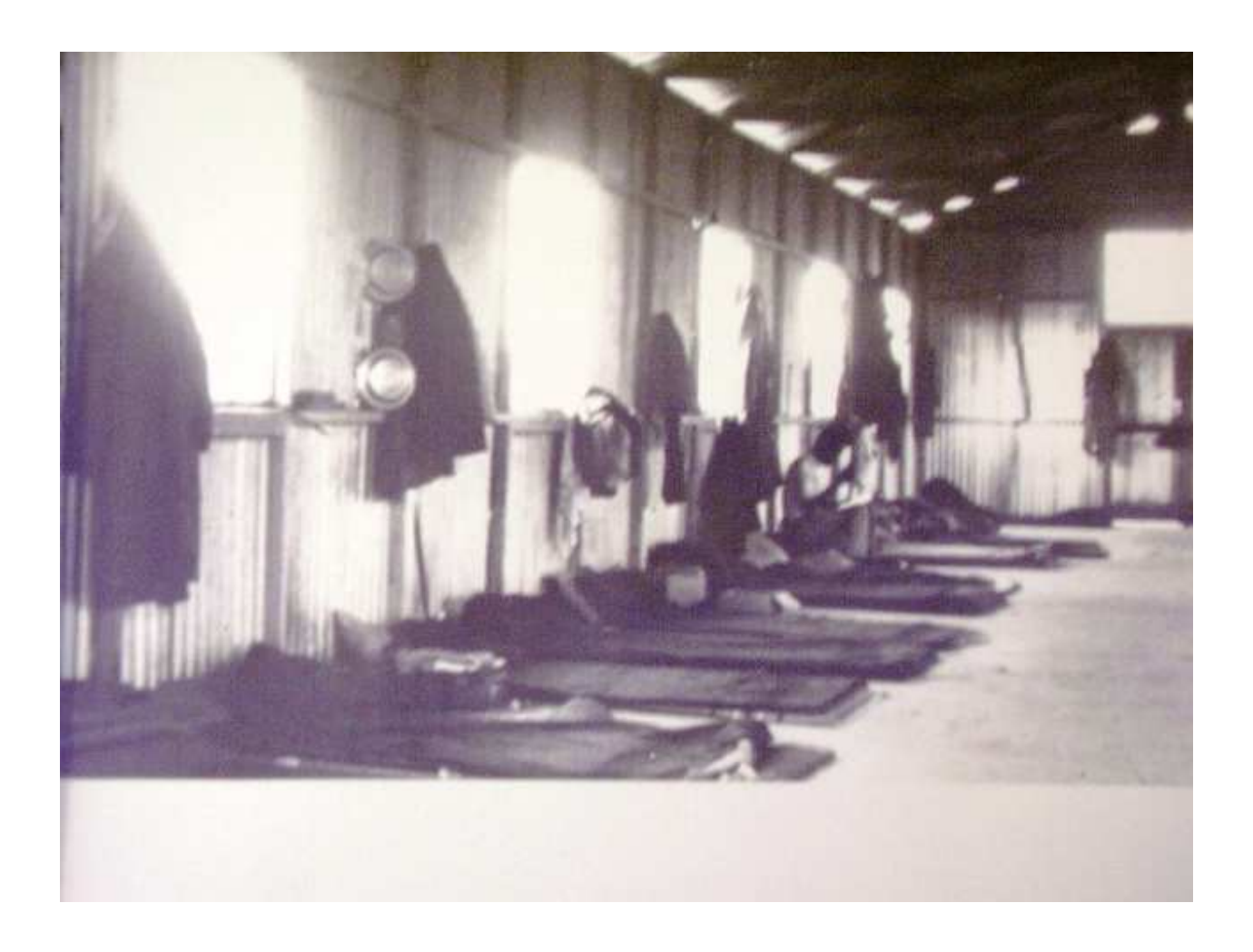
Picture 5: Picture shows the sleeping mats in a barrack at Wha Wha

The suffering of the detainees was ignored by the Rhodesian authorities who turned a blind eye. The lack of blankets coupled with the tendency by the galvanized iron barracks to trap the cold in chilly weather made winter a nightmare for the detainees.