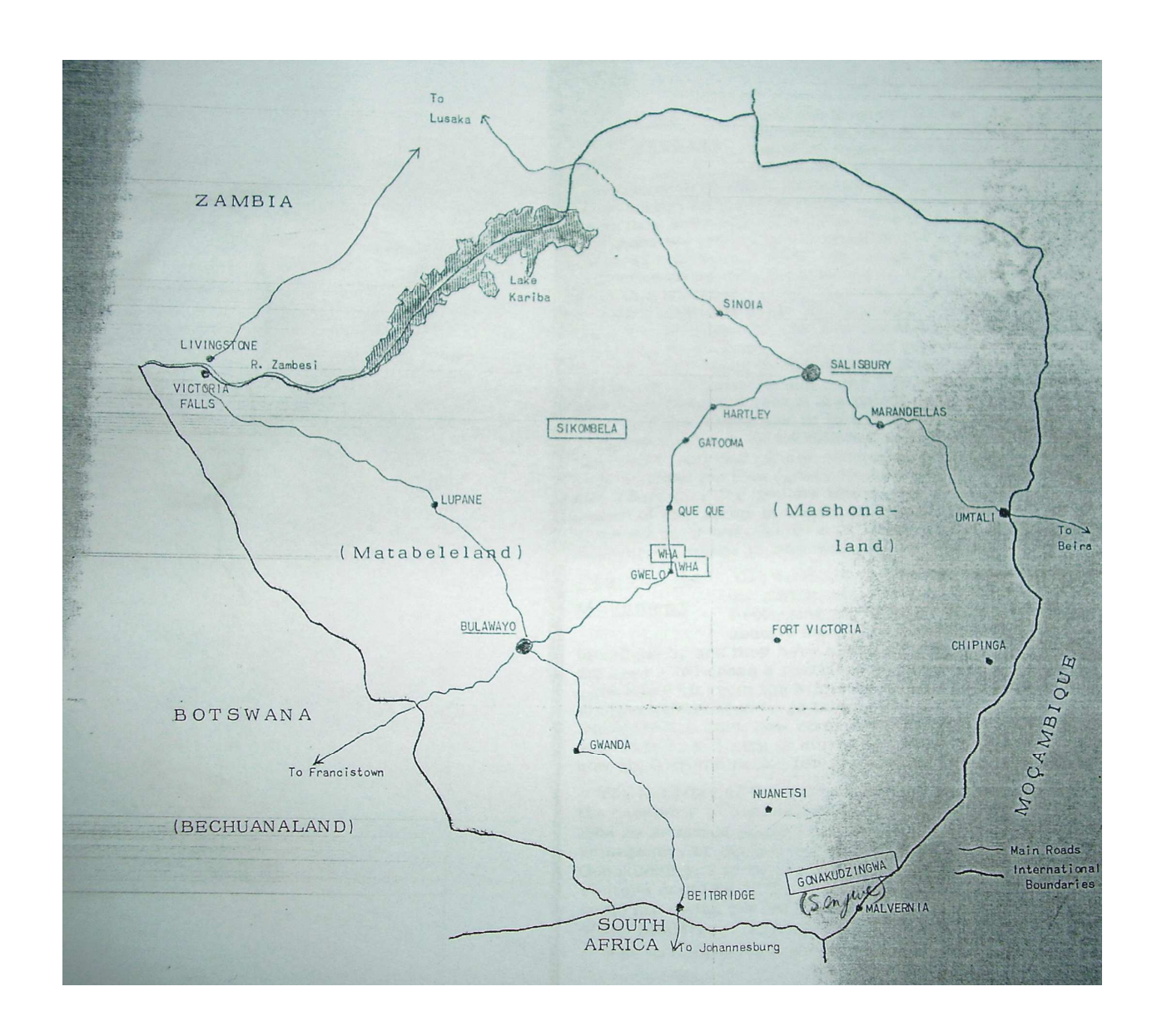
Map 1: Rhodesian map showing the locations of the 3 major detention centers: Sikombela, Wha Wha, and Gonakudzingwa [Source: Amnesty International, <u>Prison Conditions in Rhodesia</u>: Conditions for Political Prisoners and Restrictees, August 1966]

The length of time an "insurgent could be kept in detention was "indefinite". As such the prisons where political prisoners where held quickly filled up prompting the government to establish