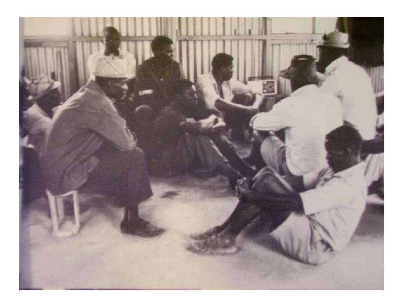
Picture 3: Detainees listening to a radio at Wha Wha, before U.D.I.

telescope at a planet far beyond our reach, the radios where especially indispensible to restrictees efforts to keep in touch with the outside world since the Rhodesian government made efforts to instill a news-blackout for the restrictees.<sup>55</sup>