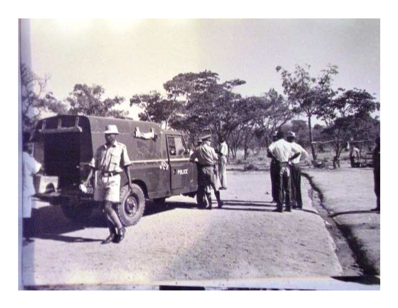
Picture 2: Rhodesian Security Force truck dropping detainees at Gonakudzingwa Restriction Camp. The bush can be seen in the background.