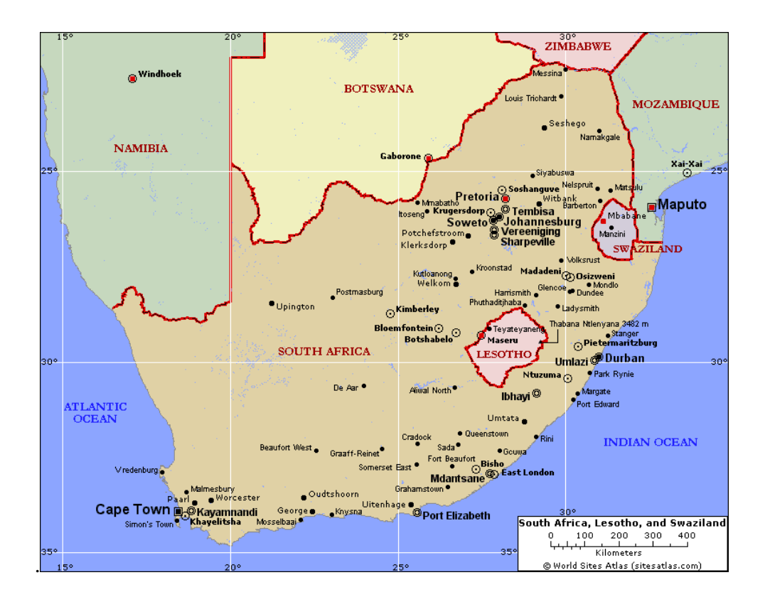
Figure 2: The Geographical Location of Lesotho

The geographical location of Lesotho and the abundance of water in the Lesotho Highlands make South African interests in that country unavoidable. Successive South African governments including the apartheid era have shown vested interest in the Lesotho Highlands water projects which now supplies vast amounts of water to the Gauteng industrial hub. Some academics and analysts interviewed were of the view that with persistent drought in the Cape area and water shortage in Cape Town, considerations by South Africa to draw water from Lesotho were highly likely. The geographical location of Lesotho completely surrounded by South Africa is shown on the map below: