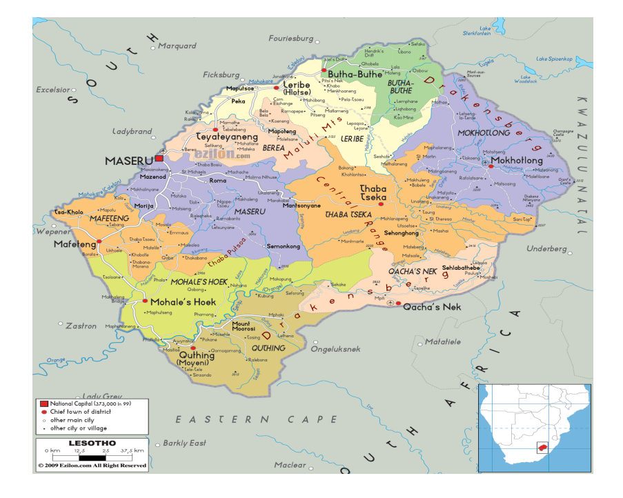
Figure 1: The Map of Lesotho

According to Monyane (2009:1), Lesotho, officially known as the Kingdom of Lesotho is a landlocked country (in Southern Africa) and is completely surrounded by South Africa. Lesotho measures 30 355 square kilometers in size and according to the 2016 estimates, it has a population of around 2 203 821 (United Nations Department of Economic and Social Affairs, Population Division, 2017). As Monyane (op.cit.) posits, only about 13% of Lesotho's soil is arable and it is found mostly in the western strip which is highly populated. The extremely skewed distribution of arable land explains the excessive population concentration in the western arable areas (ibid). The map of Lesotho is shown below.