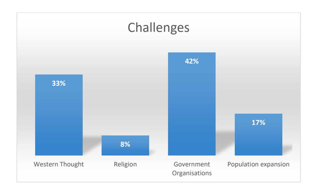
Figure 4.2: Challenges