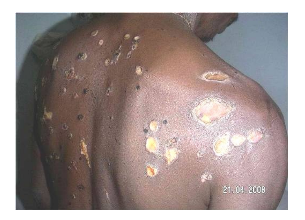
APENDIX A: Men burnt with molten plastic