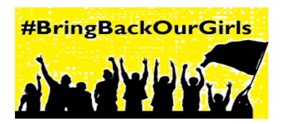
Figure 5. Artificial Image

The final two sketches to be discussed are a departure from the sketches discussed so far in that they capture groups of people. The first, figure 5, has nine people who are looking upwards as if in appeal to a higher authority.