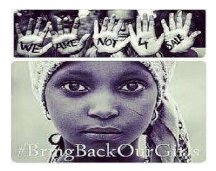
Figure 8. Real time pictures

As already observed from the real time images discussed above. Another example achieving the same purpose but collaging two images and concepts is the next image: