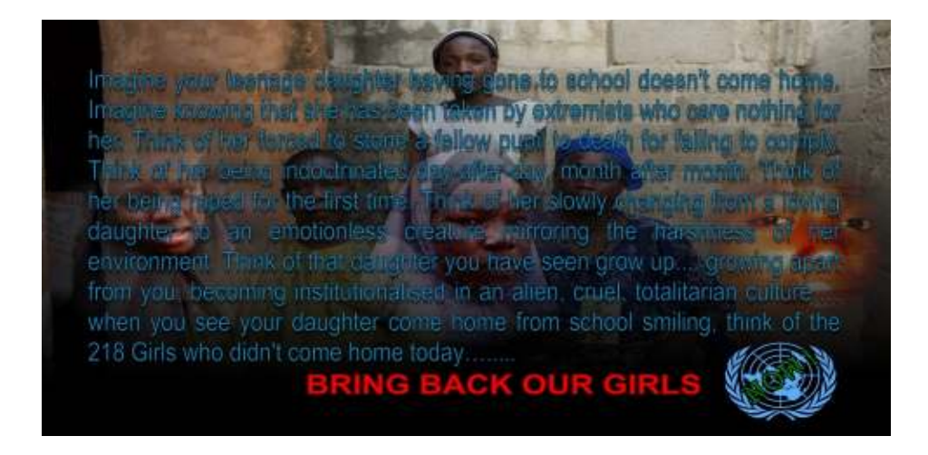
Figure 11. Real Time Images

The picture of the 'women' has girls and seemingly old ladies who might be their parents which show that the abducted girls are someone's daughter. Note the gloomy pic on the bottom right of the image which appears to be on the wall or imaginary as if to say she is a thought in their minds. The image also shows the girls surrounded by walls which might mean that they are trapped and oppressed. The story written marks one empathize with those affected and the color of the short paragraph is the same as the United Nations' logo which shows the link or oneness. At the bottom, that is, the bottom line is written in red and in bold letters which summarizes the whole appeal and message of the whole image.