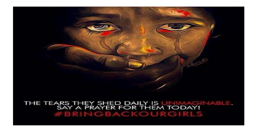
Figure2. Artificial Image

'attack or 'discredit') and construct an image to be viewed with a positive regard by audiences (in order to enhance the image) and construct an image. A number of images created during the campaign comprised sketches drawn in order to communicate specific images. Below I discuss five such sketches.