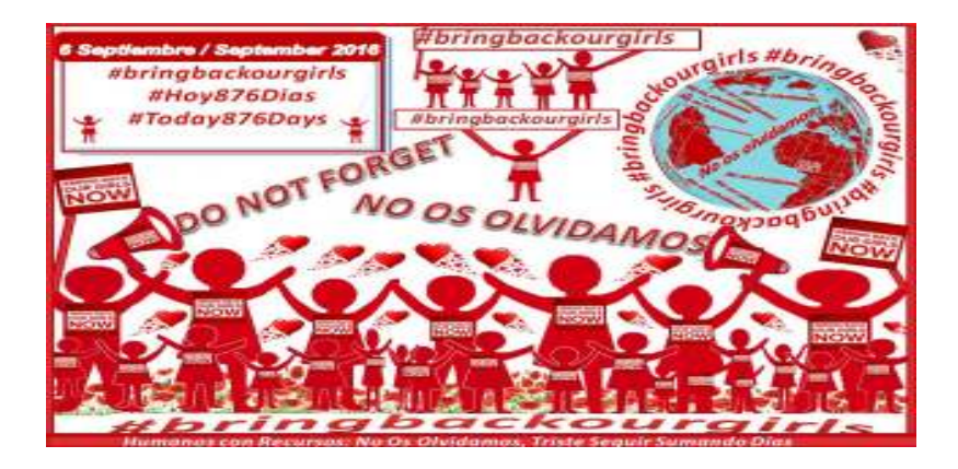
Figure 6. Artificial image

The other image showing many figures follows: