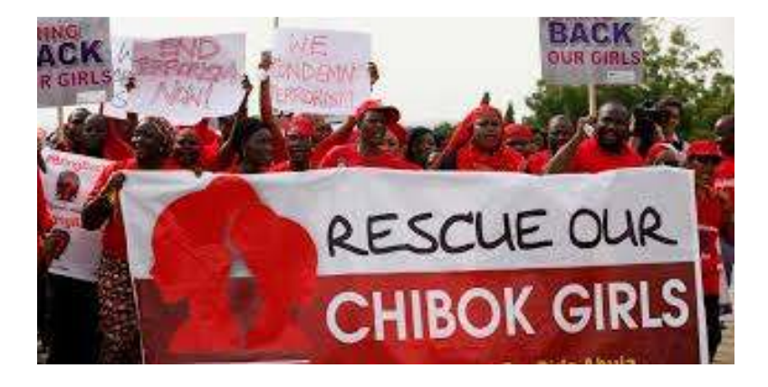
Figure 9. Real Time Images

With a different approach to the campaign is the next image which employs clear protest rather than appeal.