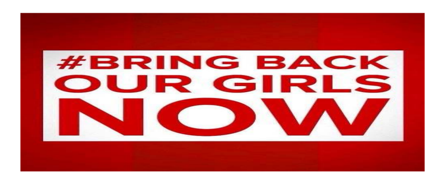
Figure 1. The #BBOG logo

Campaigns are an active means towards a goal. They are shaped by themes, a motto, a vision and a logo. The #BBOG campaign came to be associated with a specific logo, portrayed below, which communicates and symbolizes the campaign's vision. Resultantly, it suffices to make it the starting point of the analysis.