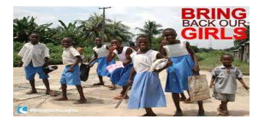
Figure 10. Real Time Images

The image portrays school children, of different ages, with smiling faces, which is an expression of excitement. What seems to excite them is the fact that they go to school, something that can be gleaned from the school uniforms they wear. Unlike the images discussed so far, this particular image shows happy faces. The reason, it seems, is to communicate what Boko Horam has stolen from the Chibok girls. Not only has it separated the girls from their mothers, but it has also robbed them an opportunity to build their own dreams and shape their destiny through education. More so, that from abducting them they took away their freedom, their peace and the smiles on their faces. The image is certainly a counter-attack on Boko Haram's propaganda against Western education.