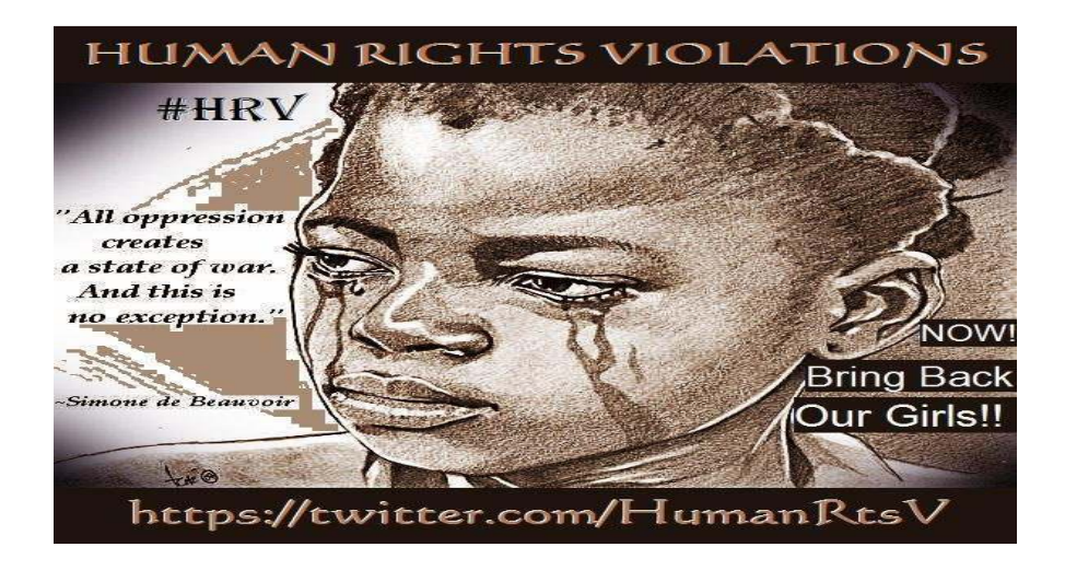
Figure 4. Artificial Image.

used raises awareness that the kidnapping of the Chibok girls is not only a human rights violation but is akin to a war atmosphere. It then makes an explicit demand by inverting the popular demand "Bring back our girls now" to 'NOW! Bring back our girls. This shows the immediate nature of the demand and the priority of the demand as "now" is not only put first but is also written in capital letters.