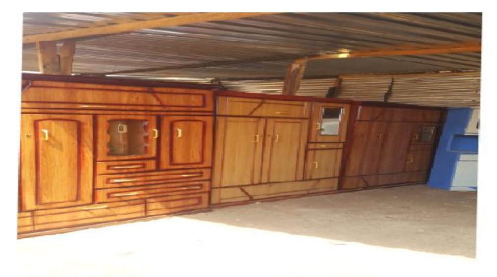
Fig 4.1: Carpentry in the Durawall