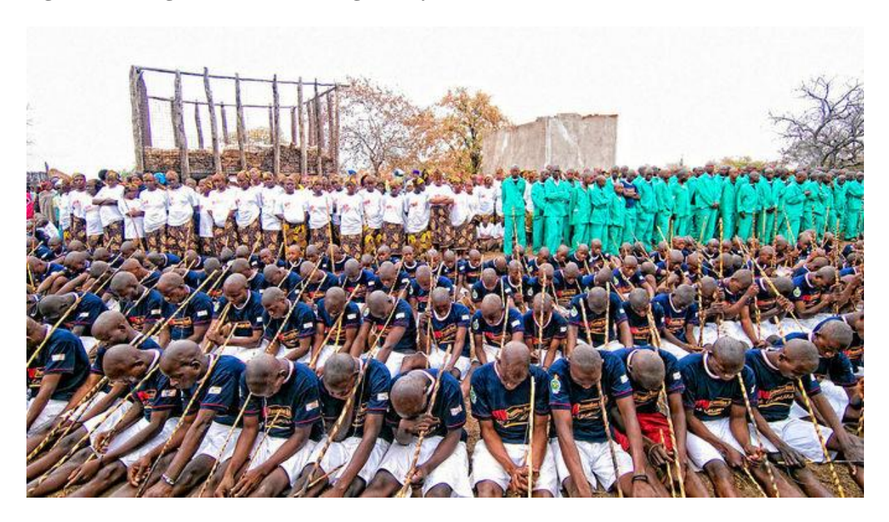
Fig 1.2 Showing Circumcised Hlengwe Boys with thumba/wooden stick