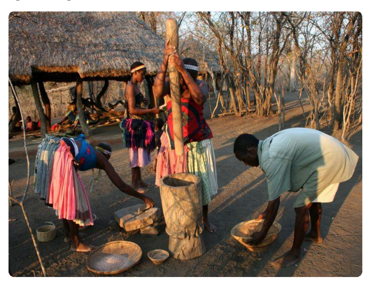
Fig 1.1 Showing Traditional roles of Girls

The major duty of Hlengwe girls were to make sure was available for the family. She was taught how to grind grains into flour. This flour was used to cook their porridge (sadza). The girl child also sweeps the hut, wash plates, pots, gather firewood and winnow.<sup>22</sup> The following photo is an illustration of duties which were played by Hlengwe children.